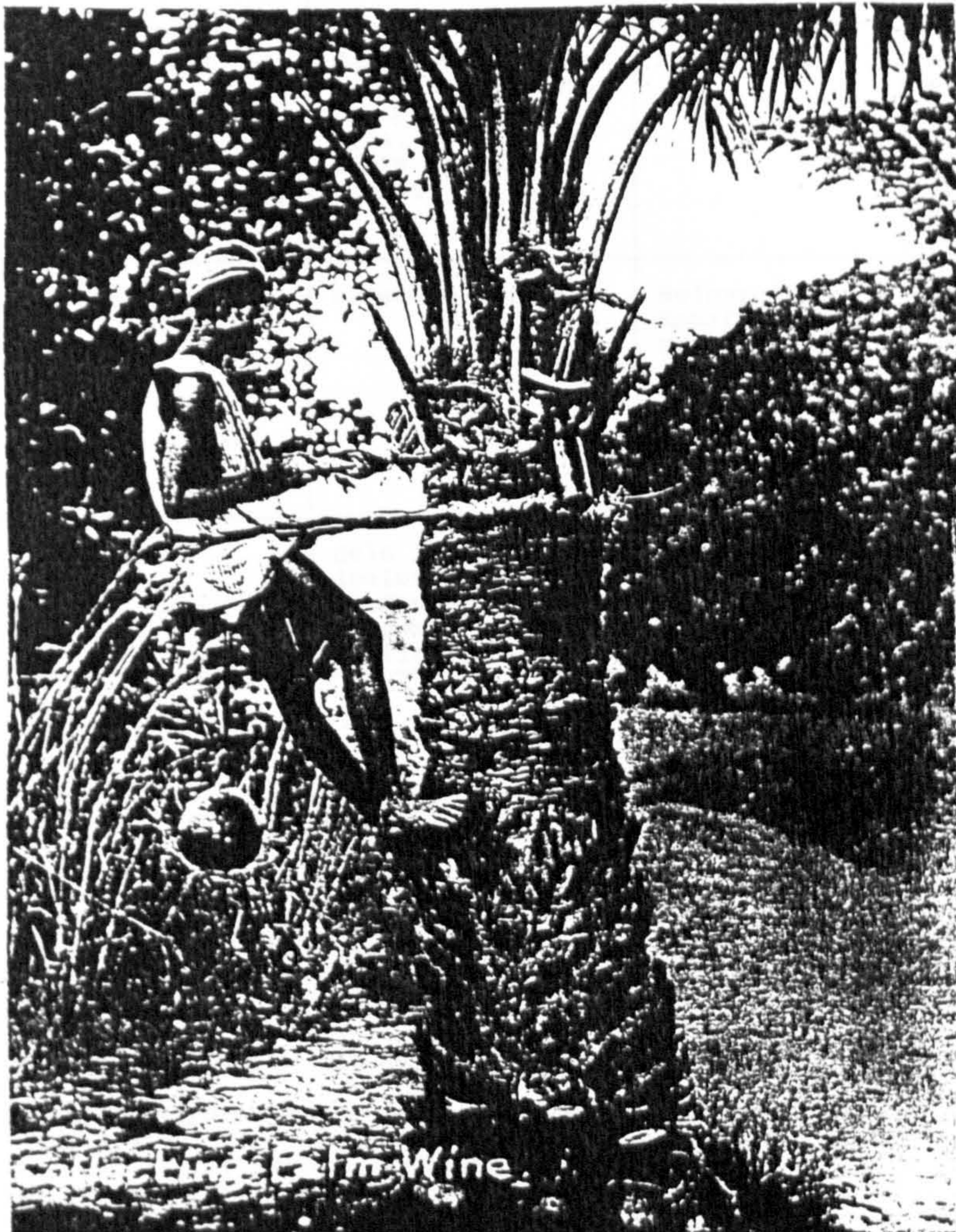
Figure 6: Man collecting palm wine in Ibadan area. (CMS, F10/88, Acc.233.).