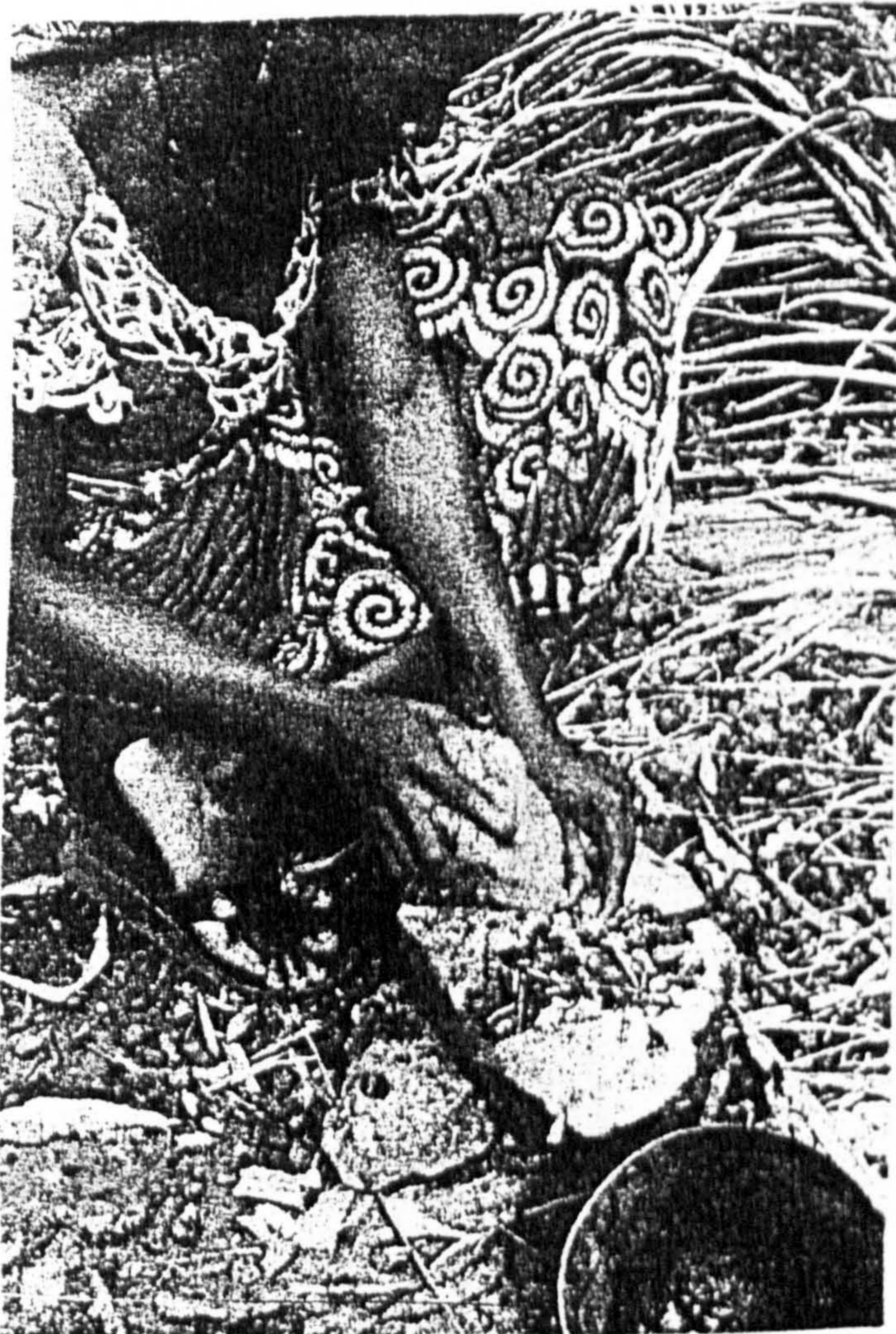
Figure 4: Woman crushing palm kernels using traditional method. (UNIFEM, Empower Tools, NY, 1995.).