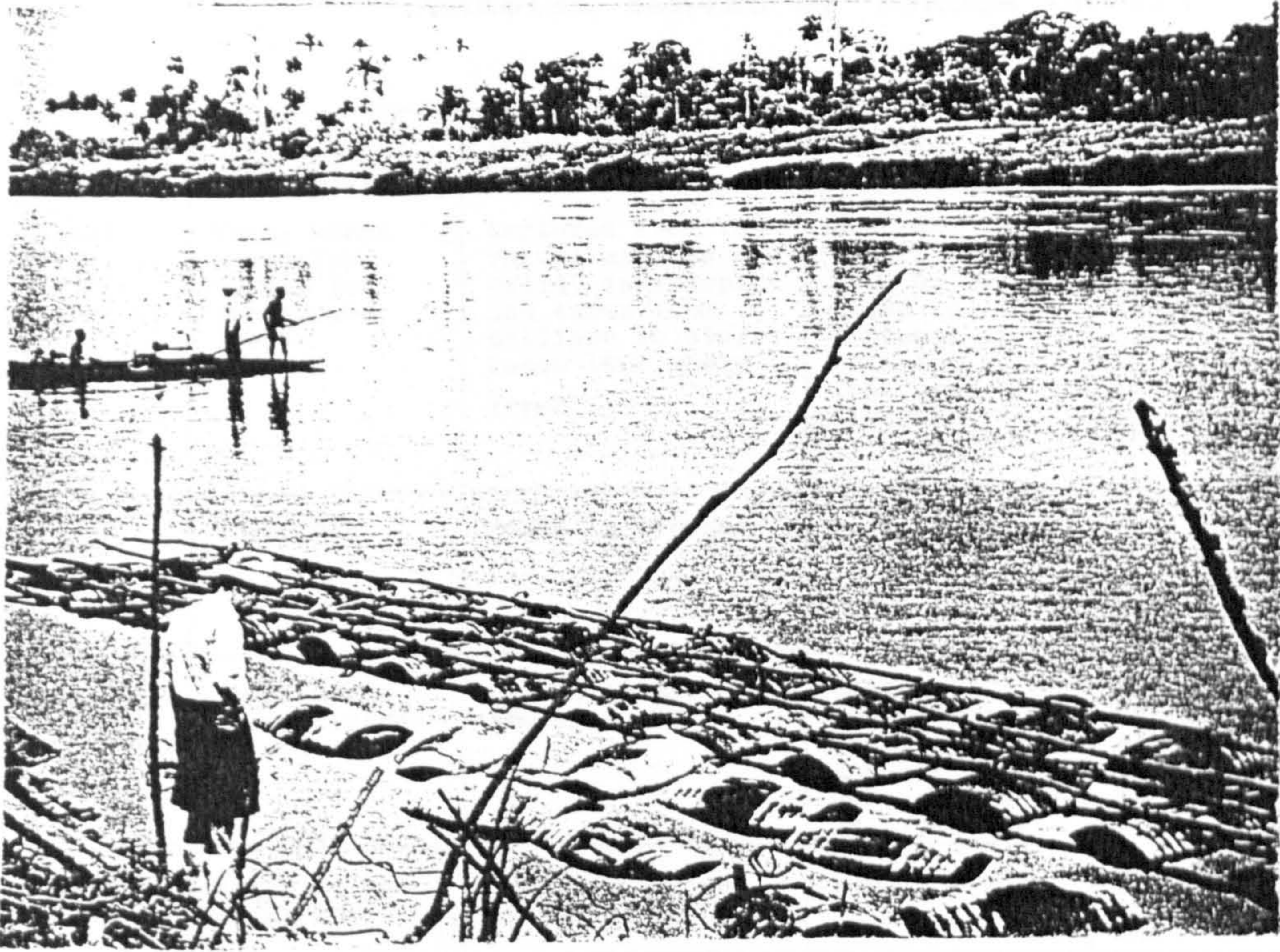
Figure 5: River transport: floating puncheons of palm oil. (E. Huxley, Four Guineas, London, 1955.).