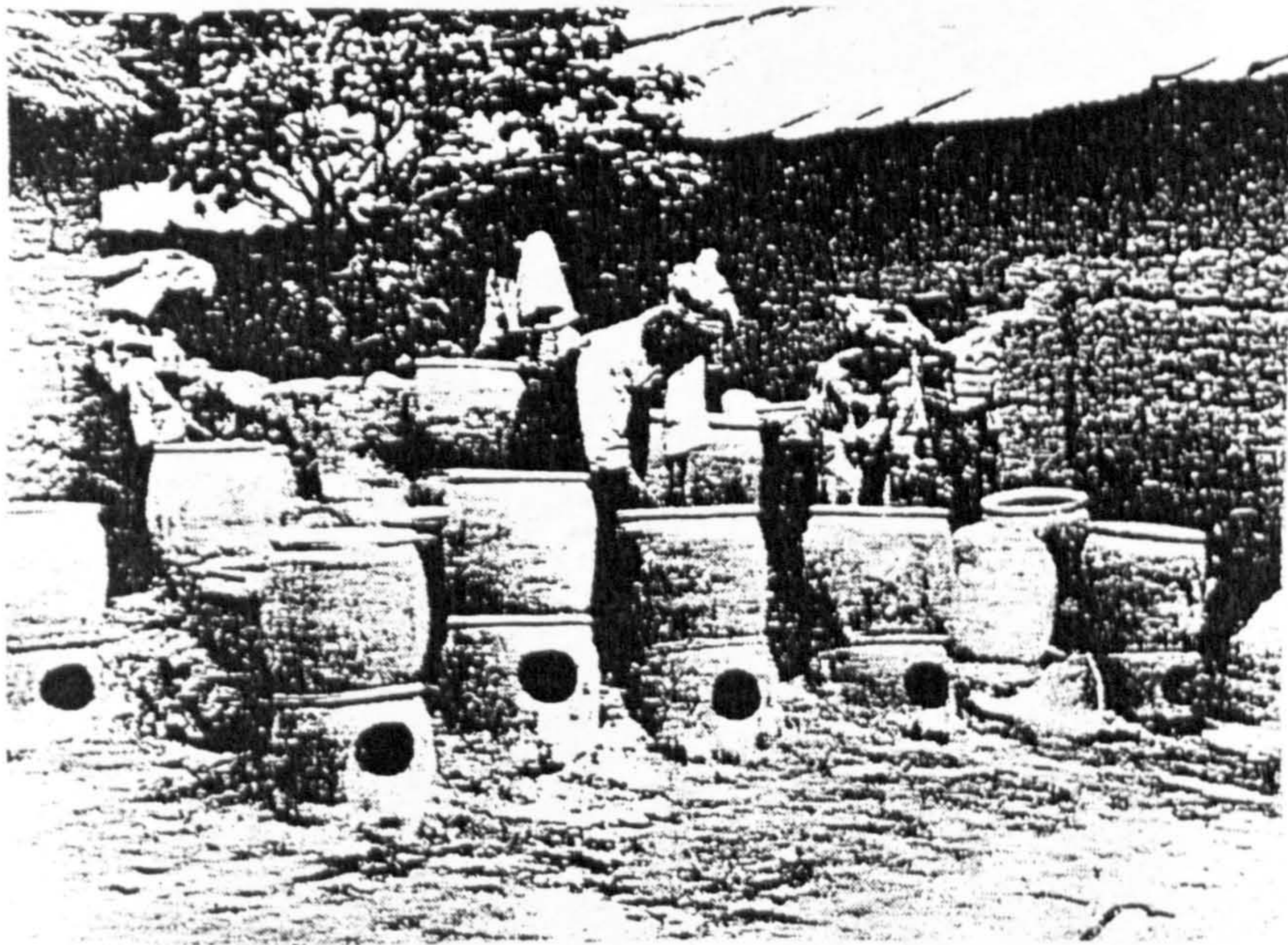
Figure 2: A dyeing establishment in Ibadan. (Grant, A Geography of Western Nigeria, UK, 1960.).