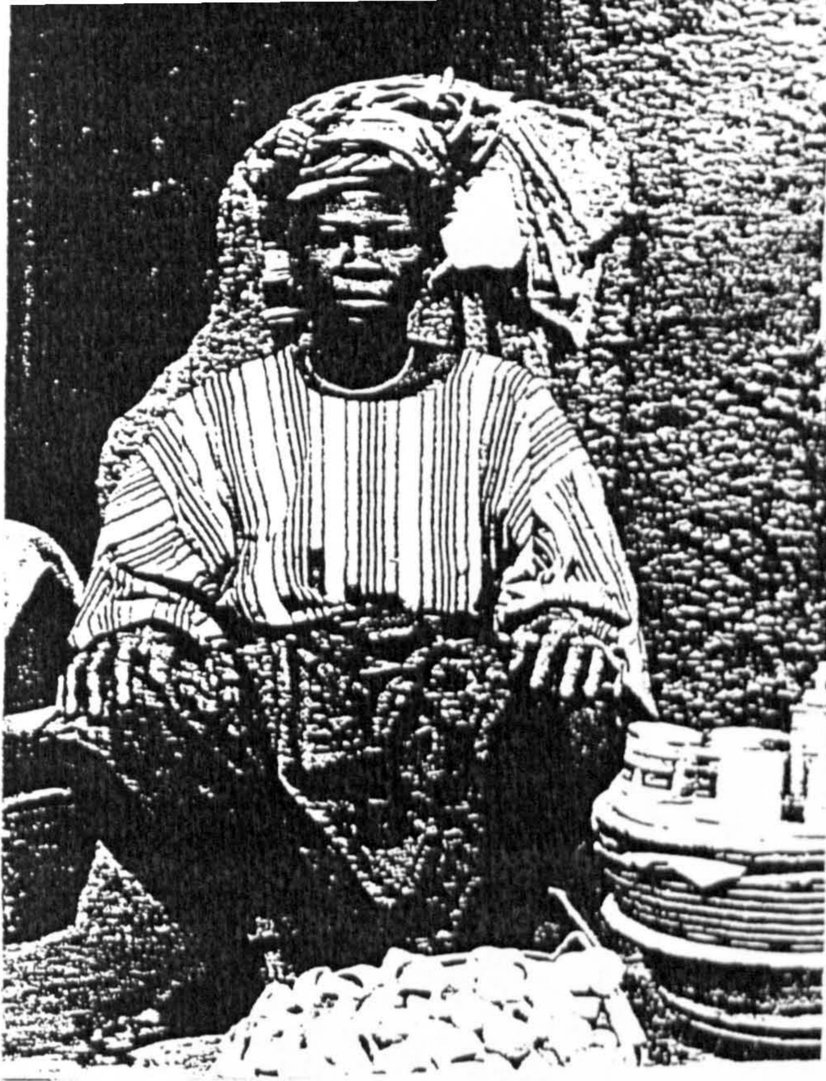
Figure 3: Woman trading at a market in Ibadan. (E. Huxley, Four Guineas, London, 1955.).