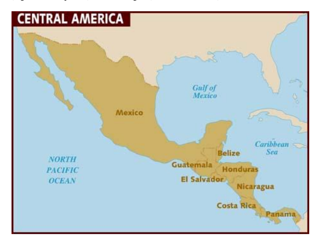
Photo 6-1 Simple map of Central America and Mexico (Lonely Planet, 2012)

(Ogren, 2007, p. 204) and Nicaragua (Field Notes, 2010).