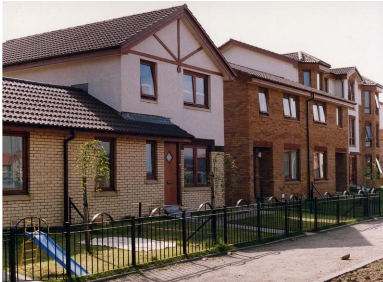
Figure 4 - New housing in Ferguslie Park following the regeneration programme