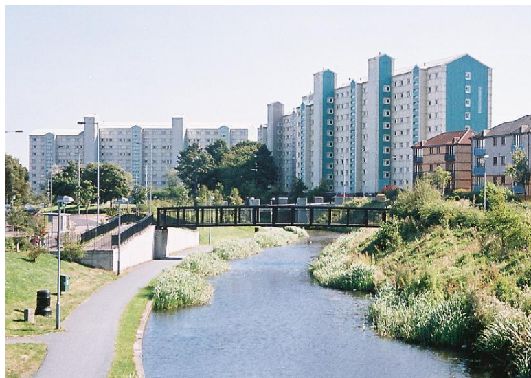
Figure 5 - Wester Hailes in 2008, with renovated and new housing and the reopened canal (author's own)

This meant the physical regeneration could be interpreted as a “success” by residents. They could enjoy their new homes rather than tirelessly complain