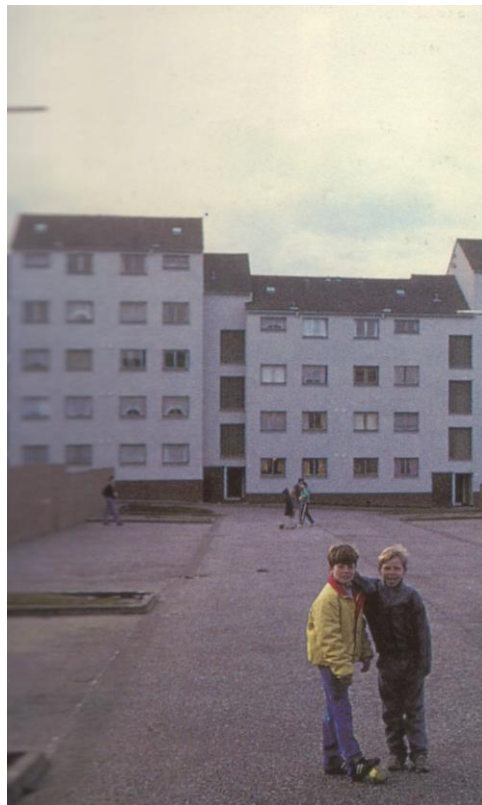
Figure 3 - Poor environmental quality of Wester Hailes (from WHP, 1989)

(Community activist iii , Wester Hailes)