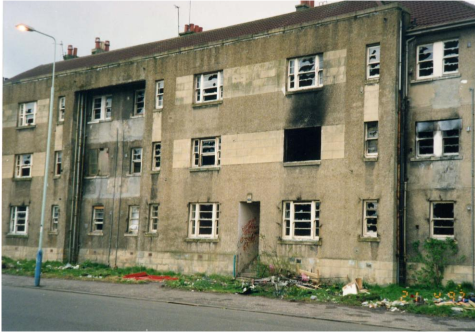
Figure 2 - One of the large tenement blocks in Ferguslie Park that housed large families, prior to demolition in the mid-1990s

Urban Scotland , had ‘tackling the exaggeratedly bad image’ of the neighbourhood as one of its key aims.