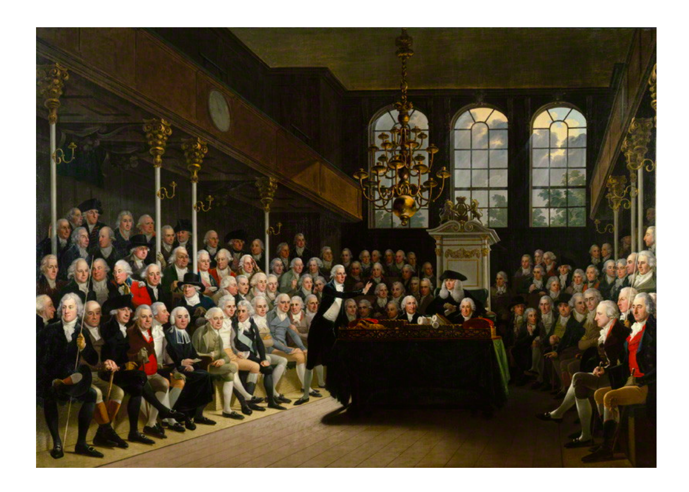
The House of Commons, 1793-4

did so, and how they perceived their roles in parliament will be addressed in subsequent chapters.