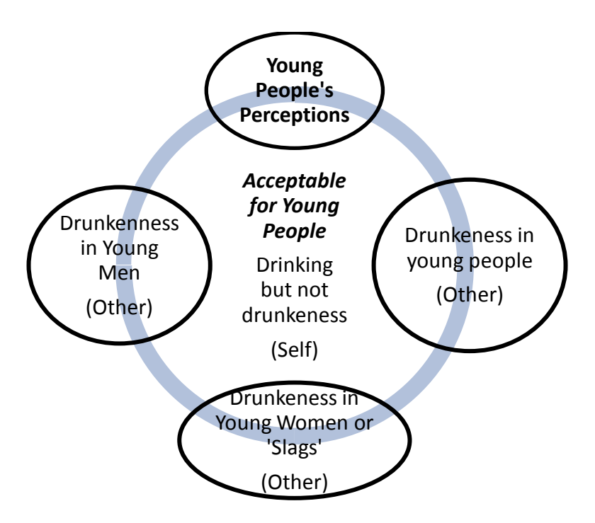
Figure 1 The next figure shows the extent to adults' perceptions towards young people and drinking:

Additionally, the study set out to identify who was perceived as 'Other' according to adults' and young people's perceptions. The diagram below shows a visual representation of young people's perceptions towards drinking, highlighting which perceptions perpetuate the 'self' or who is constructed to be within acceptable norms, and which perceptions construct the 'other' or who is constructed be outside of acceptable norms. Any young person who displays the 'other' related behaviours is then blamed for corrupting the social boundaries which have been set.