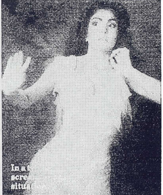
Figure A4.2: <u>Illustration Horror Fan (Winter 1989, p. 22)</u> The caption reads 'In a typical scream queen situation.'

Issues of <u>Femmes Fatales</u> feature scream queens and a few mainstream actresses who have appeared in horror or related films (e.g. Michelle Pfeiffer as Catwoman in the film <u>Batman Returns</u>) and the covers - a typical example is shown in figure A4.3 - mostly depict actresses who appear to be posing for the publication itself. The similarities to soft-core pornography are obvious and the way these images are being used to sell magazines indicates how women might be regarded within one sector of the fan industry. Whilst the depiction of actresses cowering in fear and/or in a state of undress reflects one