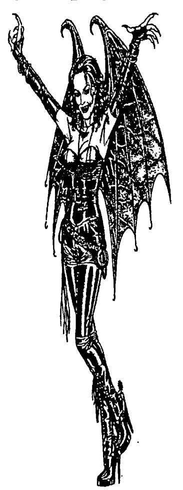
Figure 7.1 Vampire fanzine imagery (line art from The Chronicles)

In one respect, participation in Internet groups allows some respondents to make contact with other like-minded people and in particular other female fans and followers. A large proportion of the messages sent to the e-mail lists are from female subscribers: during observation of the horror e-mail list service over a three day period, fifty-six of the ninety-eight messages generated (57