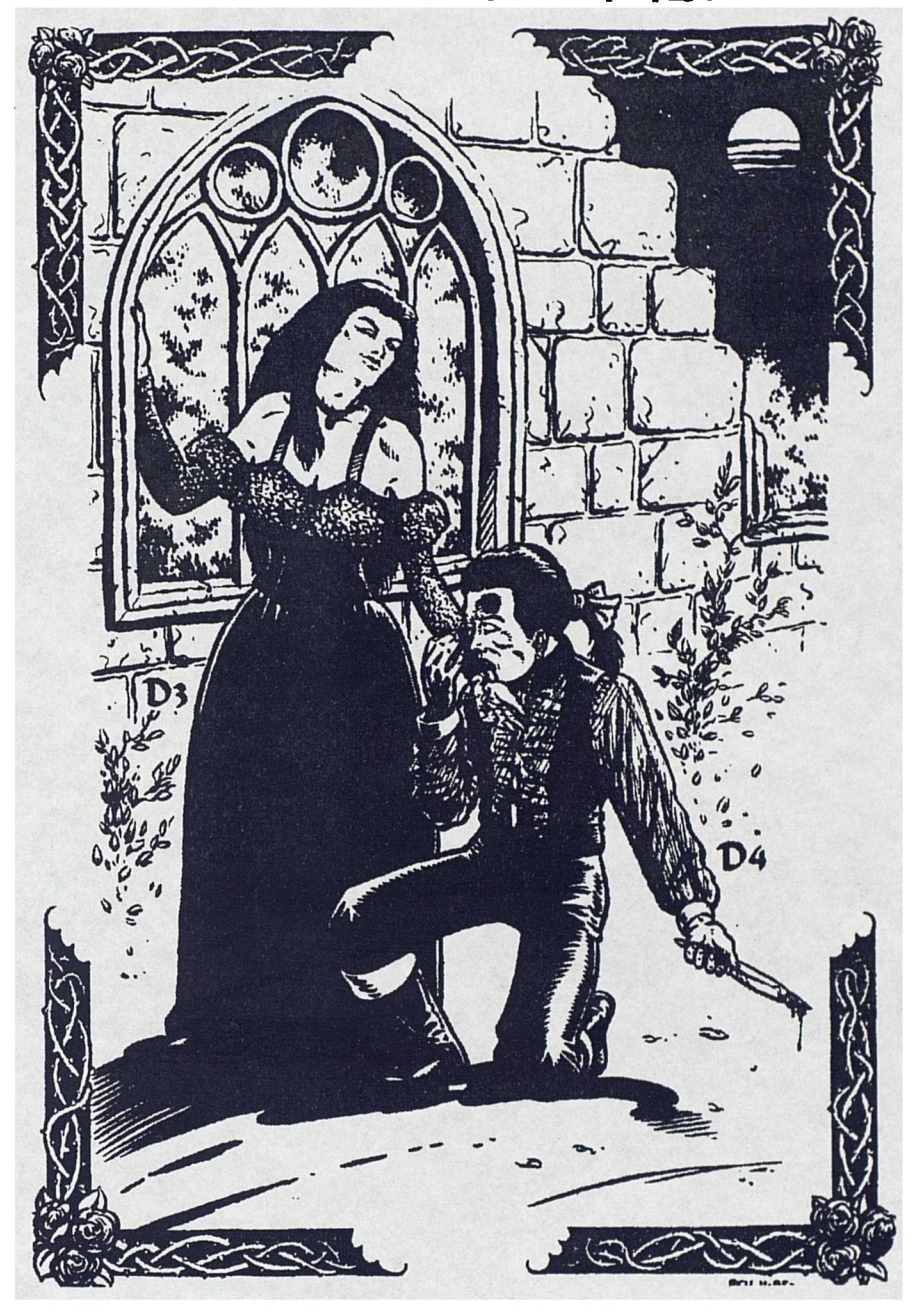
Figure 7.3 Demone mail order catalogue - sample page

becoming fixed. Mulvey (1987, pp. 16-7) states that, depending upon context, collective consciousness (unified by a ritual event such as Carnival) can either act as a spearhead for organised politics or provide a safety valve for discontent: 'In contemporary society, similar patterns may be perceived in the "rituals of resistance" associated with subcultures. A group can mark out its claim to liminal existence through clothes, music, emblematic loyalty etc.' Adoption of the vampire masquerade may, then, provide the female horror fan with a 'liminal moment outside the time and space of the dominant order' (Mulvey, p. 16) and may even allow entry into the language of politics for, as