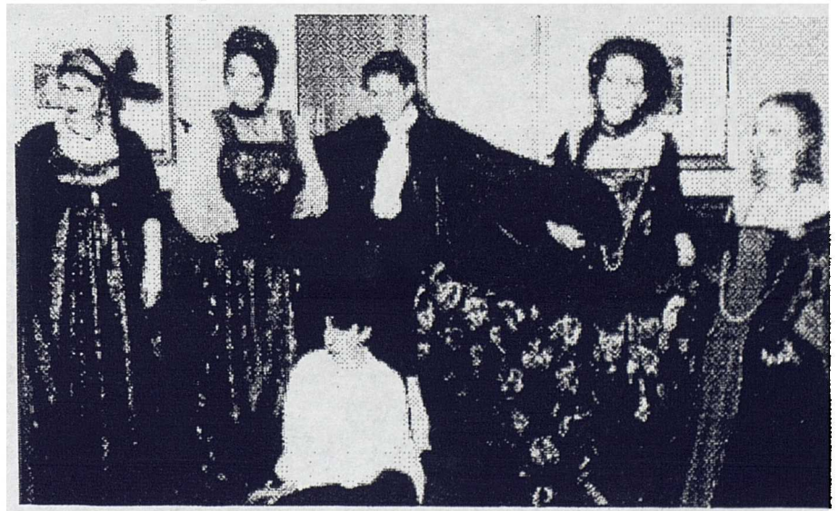
Figure 7.2 Vampire fan costumes

It would appear that, for many vampire fans, participating in fan culture allows them to dress up and act out a fantasy. The Vampyre Society is based around local groups who meet regularly in various parts of the UK. In Glasgow, many, though not all, attend in vampire costume of various forms complete with fake vampire teeth (see figure 7.2 for an example of vampire costumes). The vampire society also organises weekend vacations to country houses where masked balls and other similar activities are held. This seems to indicate a desire to appropriate historical settings and costumes, and for recreating the past and may be linked to the liking for historical costume dramas. Baert (1994) states that the property of clothing in western culture is not a stable symbol, but a circulating sign; this mobility of coding contains the potential for destroying the dominant codes of gender. The 'bad girl' look of