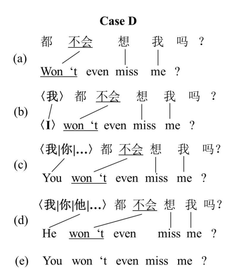
Figure 5: Effects of N-best DP generation for translation.

generates a perfect translation by weighting the DP candidates during decoding. When further increasing N (8-best), (d) shows a wrong translation again due to increased noise.