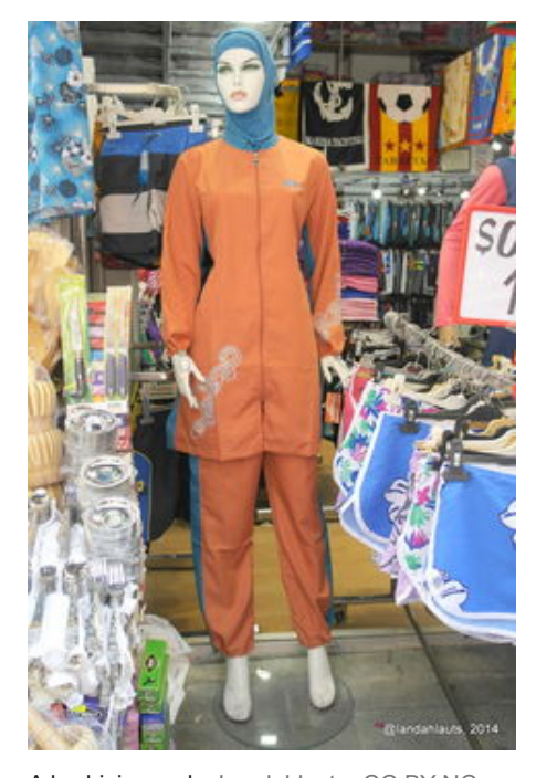
A burkini on sale.

Others, such as Laurence Rossignol, the minister for women's rights, hold that the burkini represents a "profoundly archaic view of a woman's place in society", disregarding Muslim women who claim to wear their burkini voluntarily.