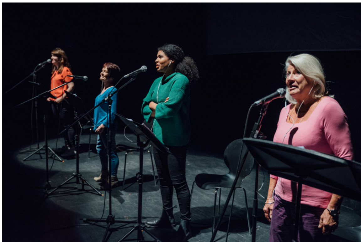
Four actresses voice men's words in Gary McNair's Locker Room Talk .

were expertly performed by four actresses channelling the voices of men of various nationalities, ages and socio-economic backgrounds.