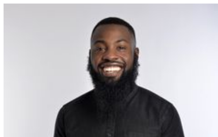
Comedian Darren Harriott who read out an anonymous woman's sexual fantasies in Manwatching .

The play opens with the author detailing what she finds attractive in a man, evaluating all physical attributes. The fact that a man reads out what a woman would find attractive in him could then potentially work as a very interesting reversal of the male gaze. This, however, was not the situation we were presented with in this performance.