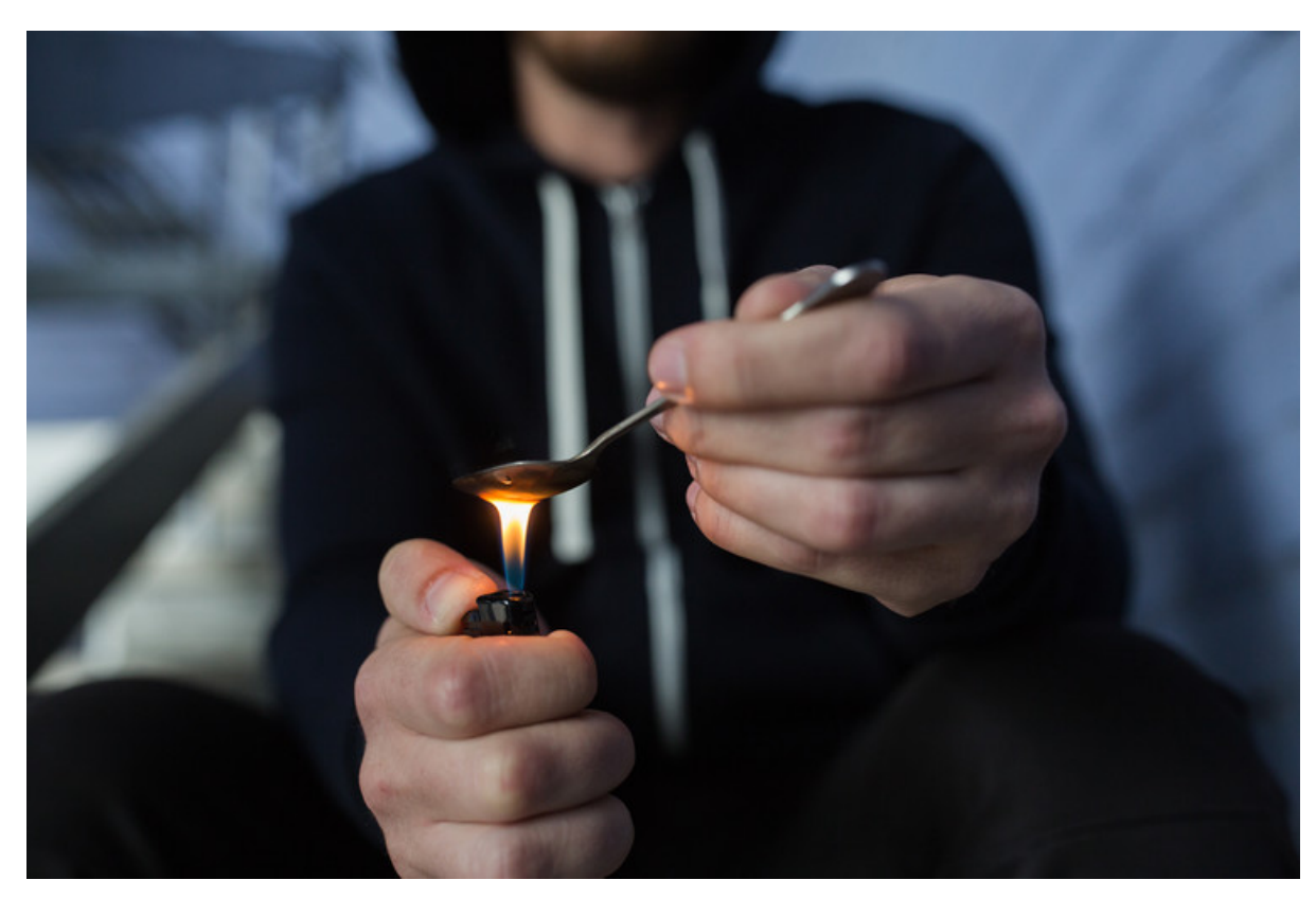
Widespread availability of street drugs, cuts in treatment programmes and general economic austerity have created a perfect storm for a drug crisis.

However, the ACMD report did make a number of recommendations that are within the gift of the Scottish government, including: continued investment in high-quality OST of optimal dosage and duration; provision of heroin-assisted treatment for patients for whom other forms of OST have not been effective; availability of the opioid antagonist Naloxone to people who use opioids, their families and friends; and provision of medically supervised drug consumption clinics in localities with a high concentration of injecting drug use. All these interventions are also recommended in the recently published UK treatment guidelines for drug misuse and dependence.