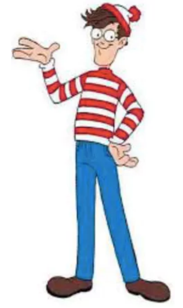
Here he is!