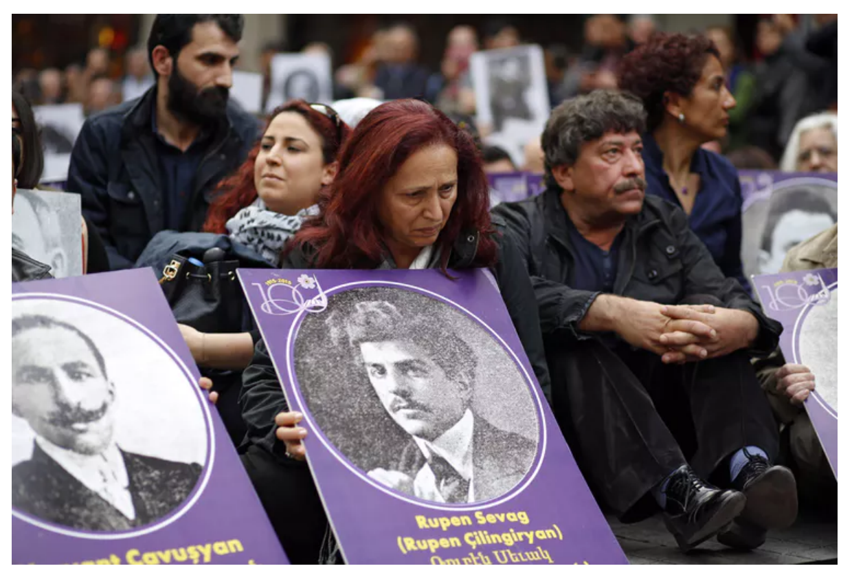
A protest against genocide denial in Istanbul.

Erdoğan has repeatedly shown his willingness to crush anyone who opposes him, and his government is clearly closing up the space for dissent in the Turkish public sphere. Denying a historic genocide perfectly serves the interests of this regime, one that normalises state violence, relentlessly promotes its own narrative, and punishes any opposition.