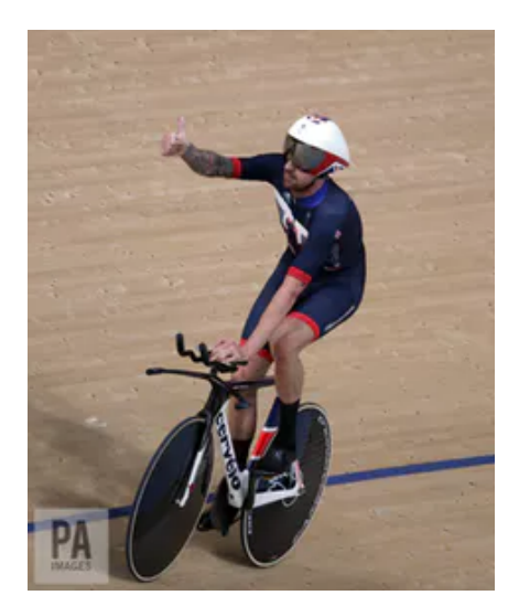
Sir Bradley Wiggins has benefited from TUEs to help him deal with a pollen allergy.

While the TUE system appears to be concerned about athletes' health by allowing them to use medicines, there are some ways in which the use of such medicines is detrimental to their health.