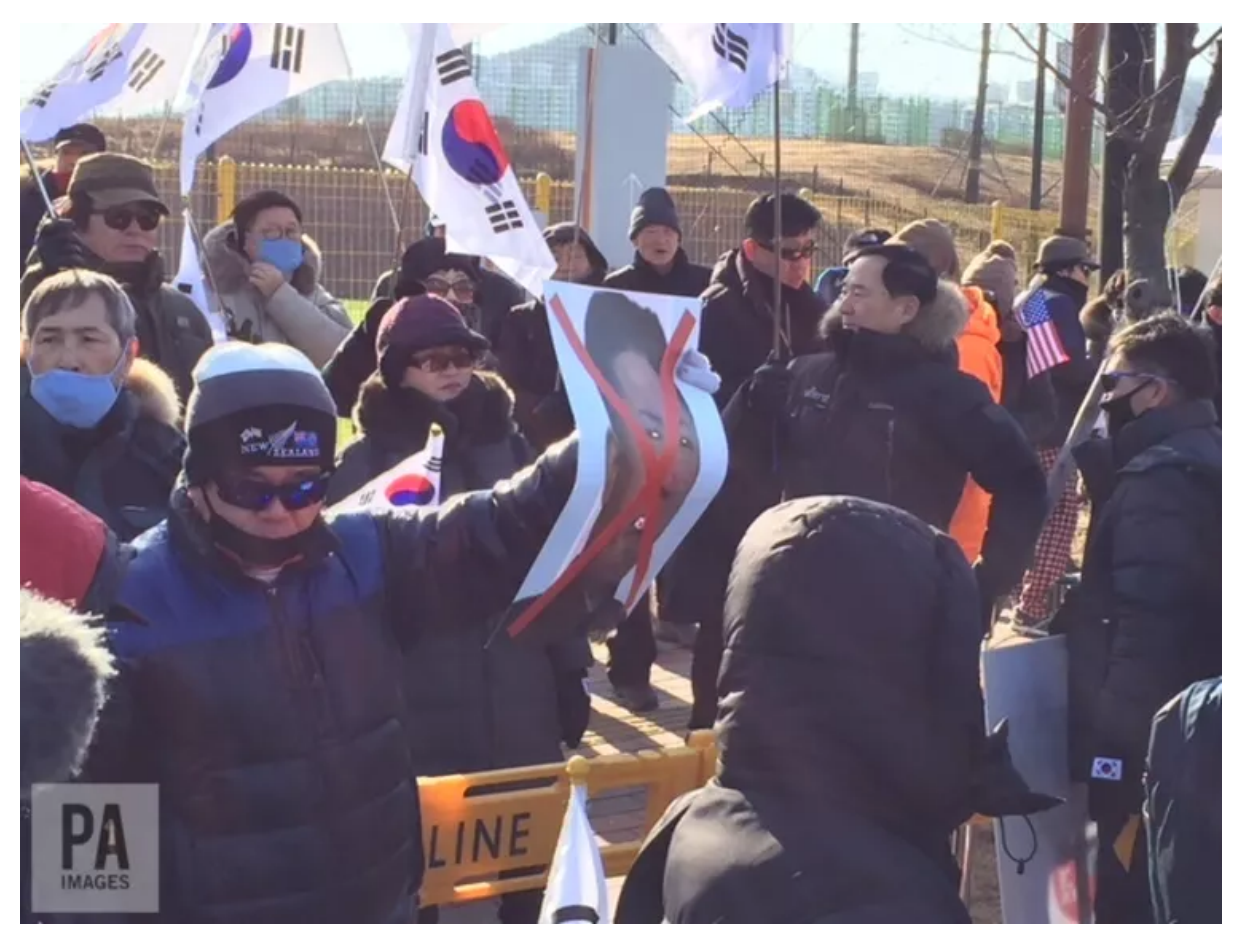
Protesters in Seoul outside a rink where the joint North and South Korean women's ice hockey team was playing a practice match with Sweden on February 4.

Following the Korean War (1950-53) between the US-backed South and the North, backed by the USSR and the People's Republic of China (PRC), the uneasy truce suspended but did not resolve the conflict between the neighbours. But despite these divisions, Korean people share a common culture and history that long predates their war.