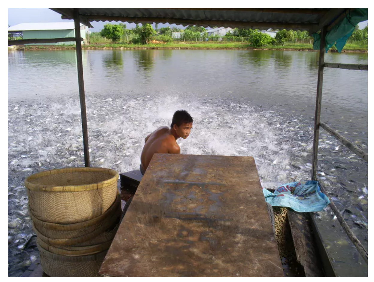
Farming pangasius catfish for export in Vietnam.