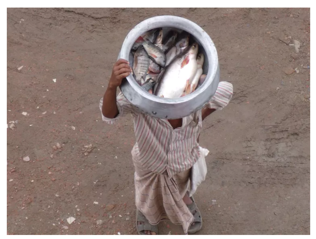
Mobile vendor selling affordable fish in Bangladesh.