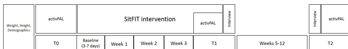
Figure 1 Intervention and data collection timeline.

Separate semistructured interview guides were developed for each follow-up time point. The interview topics at T1 were: how the participants used the SitFIT and which aspects they found more and less useful (in particular, the feedback on sedentary or upright time). At T2, the interview focused on the maintenance of behaviour change. The first interview lasted 20–30 min, and the second interview lasted around 5 min.