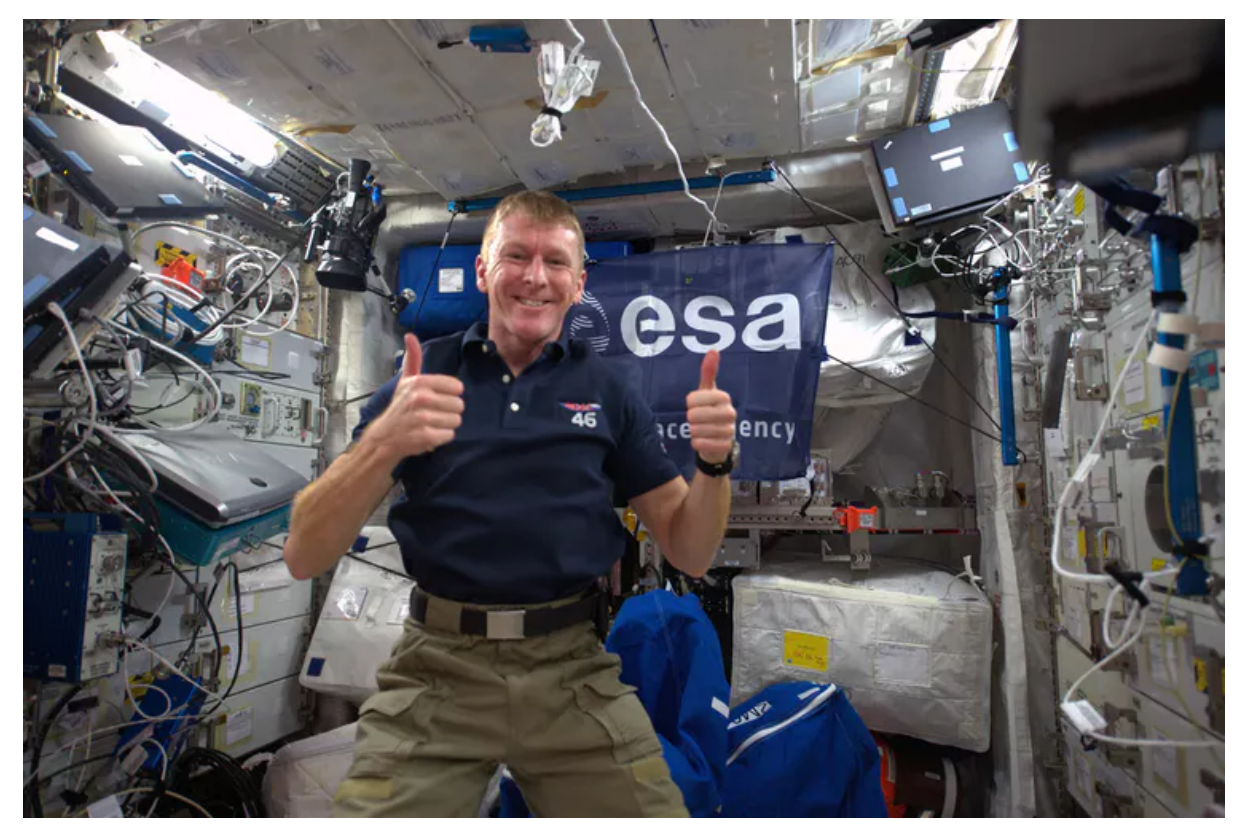
Feeling good: Tim Peake aboard the ISS.

After nine to 14 days of spaceflight, for example, research shows that aerobic capacity (VO2peak) is reduced by 20%-25%. But the trends are interesting. During longer spells in space – say, five to six months – after the initial reduction in aerobic capacity, the body appears to compensate and the numbers begin improving – although they never return to pre-trip levels.