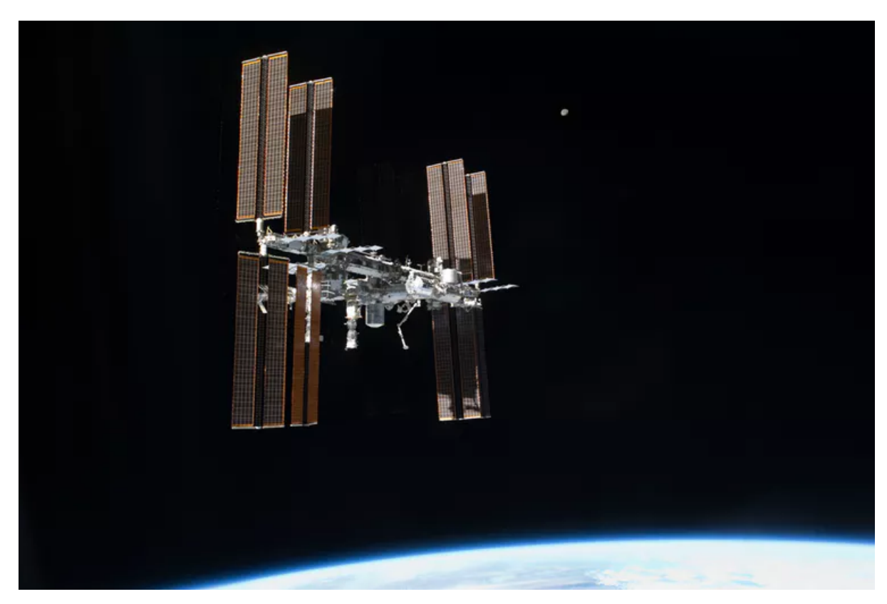
ISS: a healthy home?