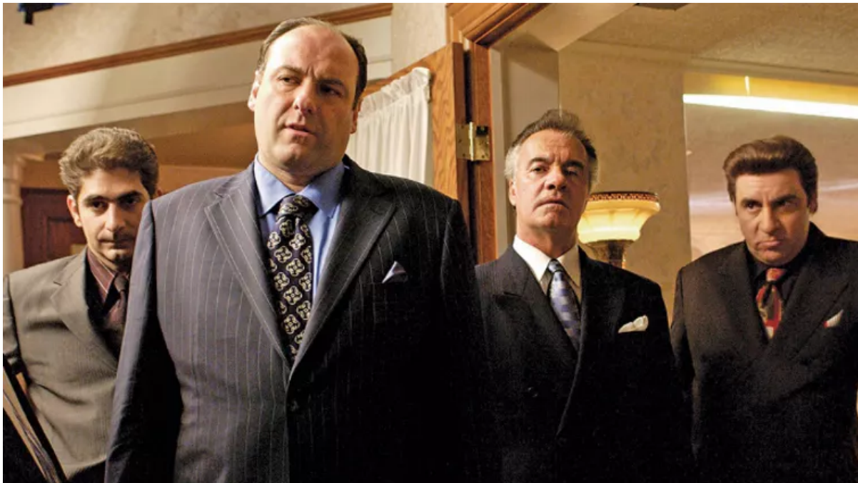
Popular portrayals of the mafia, such as The Sopranos , lend organised crime groups glamour and cachet.

But like the Wizard of Oz booming from behind the curtain, much of this is just smoke and mirrors – amplified bluster. Popular portrayals of mafia-style crime depict prominent villains as powerful figures within communities, who in the absence of effective policing, exert alternative forms of control, commanding authority and loyalty.