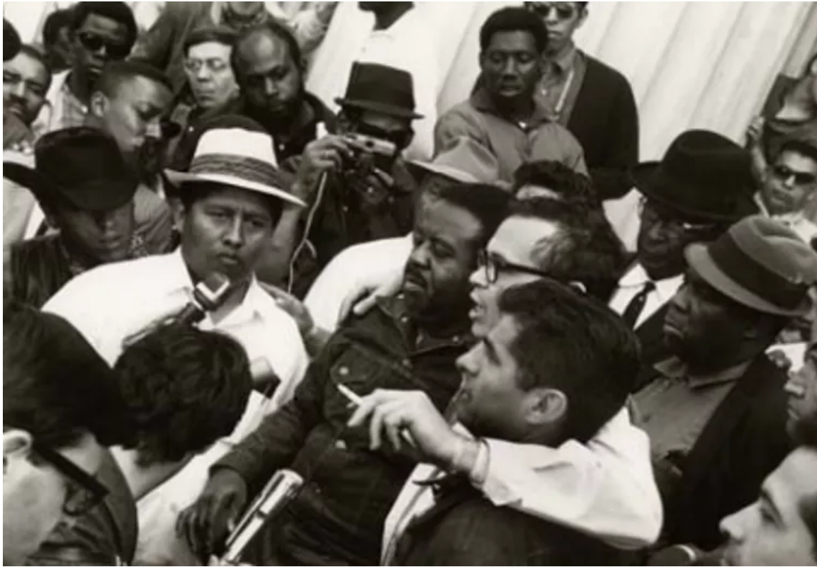
Native American activists join Martin Luther King's Poor People's Campaign on a march in Washington DC in 1968.