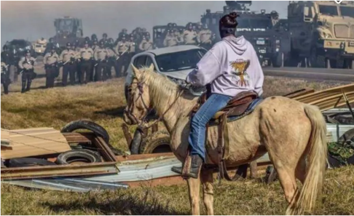
A Native American protester faces police at Standing Rock Reservation in 2016. The campaign against the $3.8bn Dakota access pipeline continues.