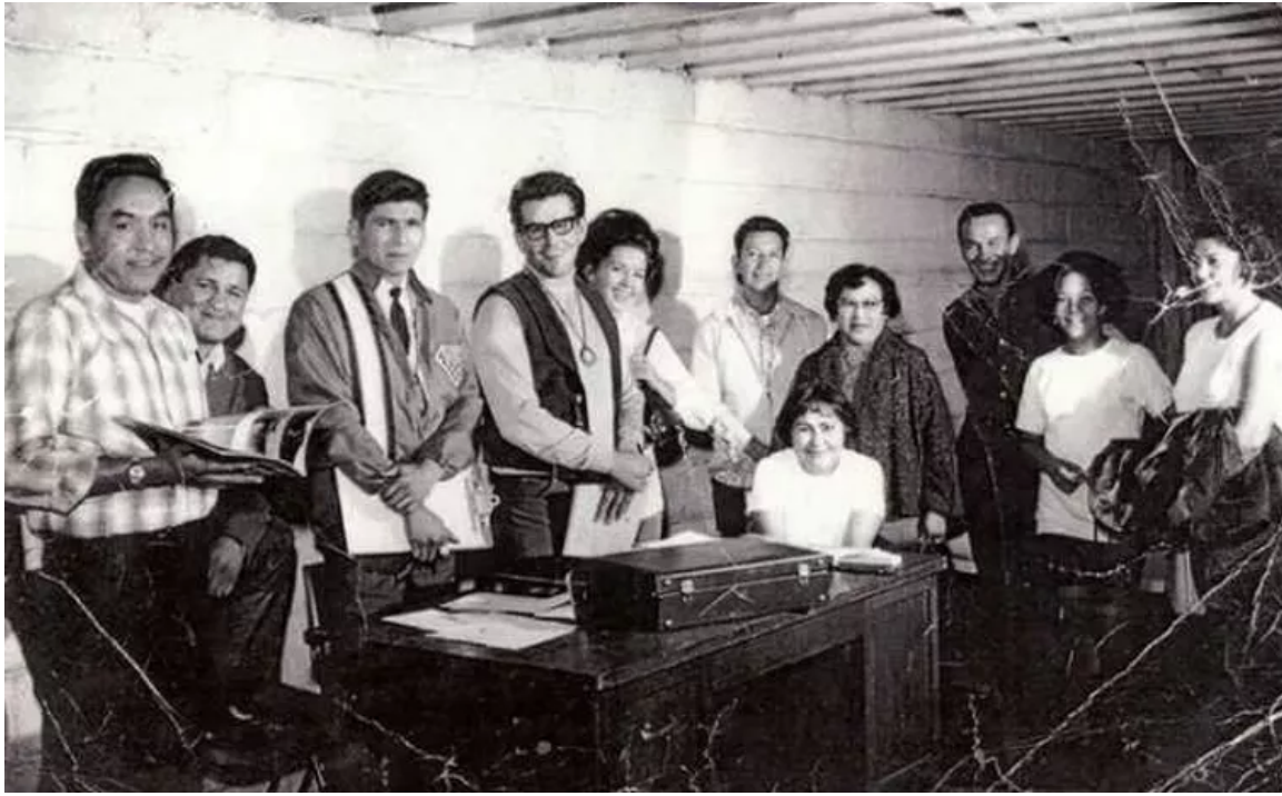
The first board of the American Indian Movement in 1968.

In the early 1970s, the emergent Native rights movement built alliances with traditional communities and shifted the struggle to injustice in reservation border towns and the Bureau of Indian Affairs – the government agency that had controlled Indian life for 150 years. In this phase, sovereignty meant legal protection against racism, more resources, and a greater role in local policy and decision making.