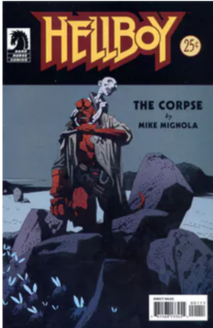
Hellboy: The Corpse. Dark Horse Comics

An excellent example of the Hellboy series, written and drawn by Mike Mignola.