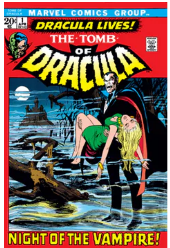
The Tomb of Dracula. Marvel Comics

of a larger Hellboy story arc, The Corpse is also a standalone piece that is a good representative of the narrative tone and art style of the rest.