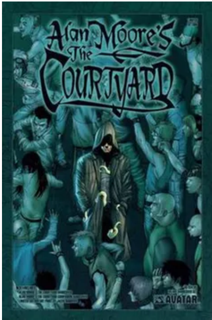
Alan Moore's The Courtyard . Avatar Press

The Courtyard is a comic adaptation of Alan Moore's graphic novel of the same name: his first, meticulously-researched interpretation of HP Lovecraft's ever-popular cosmic horror cycle.