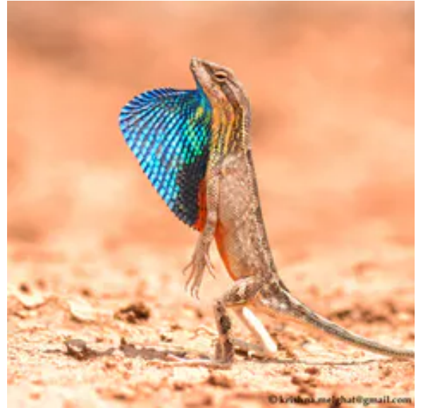
The superb large fan throated lizard has only been classed as a separate species since 2016.

In areas with turbines, they also found fewer birds of prey such as buzzards and kites (the lizards' main predators), and a lower frequency of attacks on lizards. Putting the two together, the authors propose that the presence of turbines is associated with lower predator activity, and thus higher prey numbers.