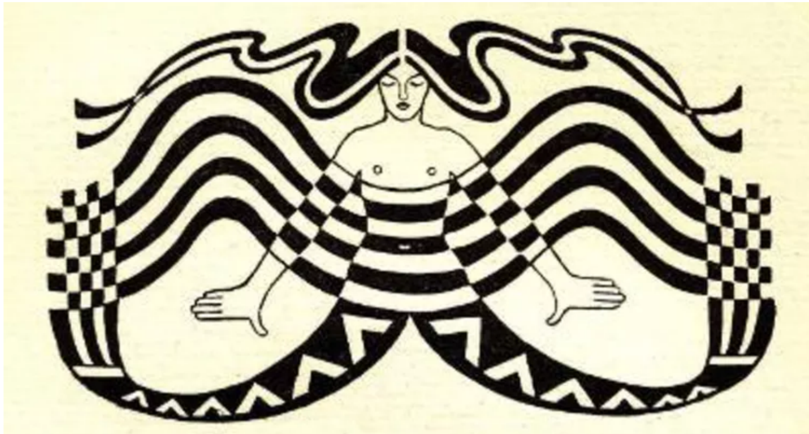
The work of Scots symbolist painter and designer John Duncan had Celtic influences.

The strengths of the V&A's own Scottish collection, which have shaped today's Scottish Design Gallery, lie in the period from the 15th century to present. This reflects the ethos of the 19th-century V&A. However, my research shows that Dundee and the V&A have a history that goes back to the late 1880s – which did embrace earlier Scottish design from the 8th century onwards. To understand why this material might not be present in V&A Dundee, we need to look at the history of creating and circulating replica artefacts, and what has happened to them since.