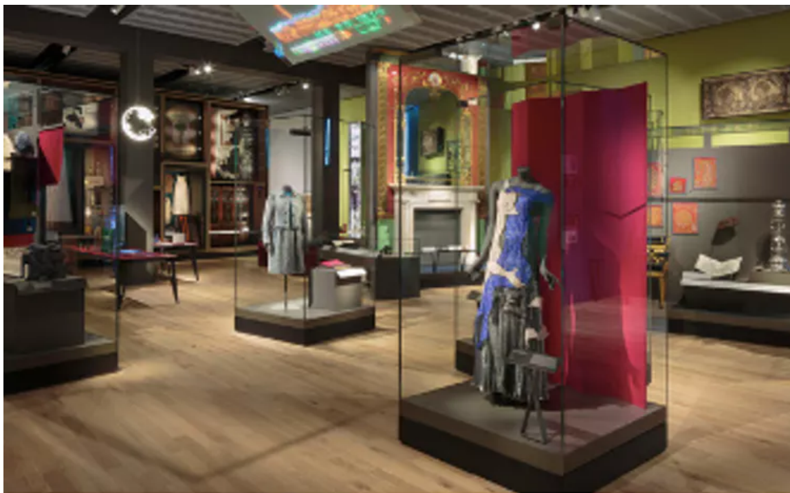
The new Scottish Design Gallery at the.

Visitors to Dundee's new V&A will hopefully get a chance to visit the McManus Gallery whose earlier history is bound up with the V&A in London. While a plaster cast, particularly a Scottish Celtic subject, might today have spoken for that earlier relationship, none of Dundee's V&A-assisted collection now survives (although equivalent collections do in Glasgow's Kelvingrove and Aberdeen Art Gallery).