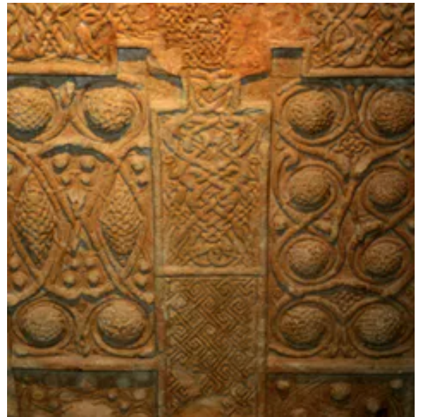
Nigg Pictish cross slab.

Between 1894 and 1917 V&A staff visited and advised on annual loan collection displays, educating teachers about new exhibitions, and giving lantern-slide lectures to the public. The Albert Institute (now The McManus) had begun acquiring plaster casts of sculptures and other types of reproductions, including the Elgin Marbles. In 1904, Dundee acquired casts of some of the finest Celtic crosses in Scotland.