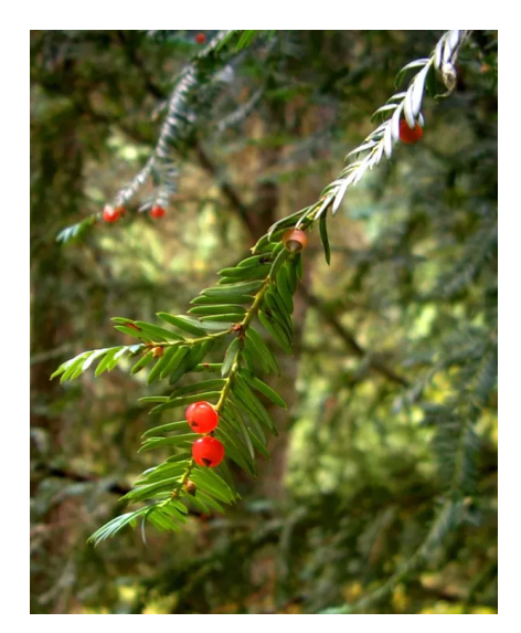
The Pacific yew tree ( Taxus brevifolia) foliage and fruit.

They've both given us drugs that have saved and improved the lives of millions of people. Paclitaxel, originally isolated in 1971 from the bark of the Pacific Yew tree, is so important for treating various cancers that it is one of the World Health Organisation's "Essential Medicines". This compound has been studied in more than 3,000 clinical trials. It's safe and effective and it generates sales of around US$80-100m per year.