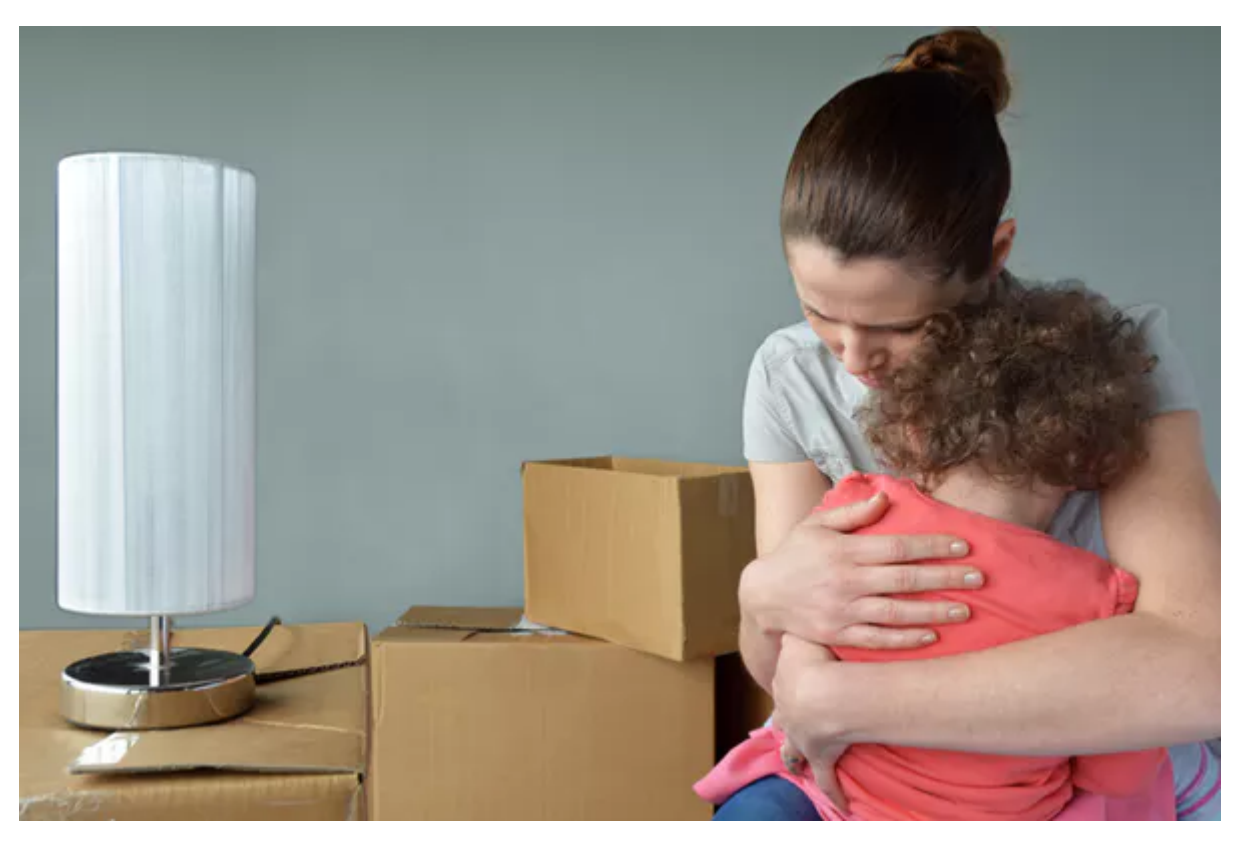
A difficult move.

It's clear that highlighting the tensions between millennials and baby boomers will do little to address these issues: in fact, there is much support and solidarity between the generations. Young people were clear about who they blamed for the current situation: not their parents, but government, and its inability to address the housing crisis and provide the affordable housing they needed.