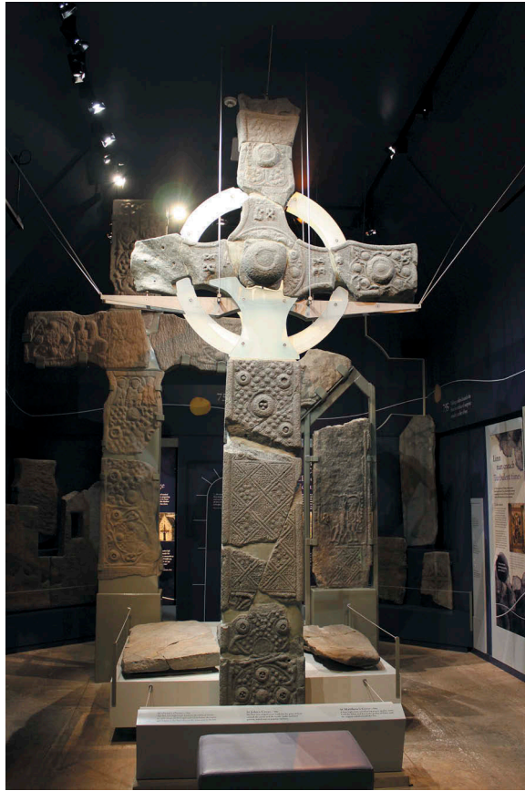
Figure 3. St Oran's, St John's and St Matthew's Crosses relocated for conservation purposes in the Iona Abbey Museum, upgraded in 2013.