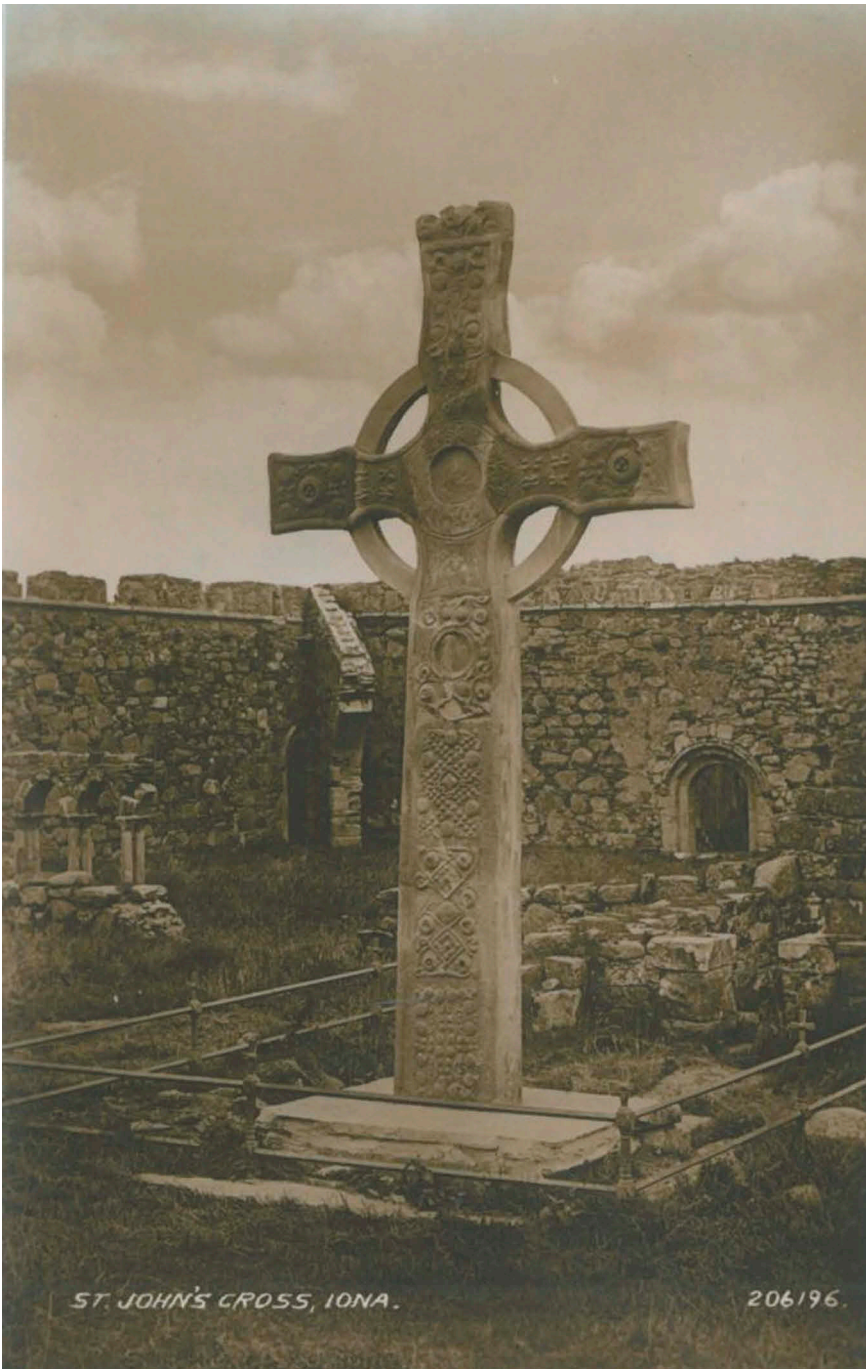
Figure 6. St John's Cross (the reconstructed original) standing in front of the Abbey ruins in a postcard from 1927 or shortly after.