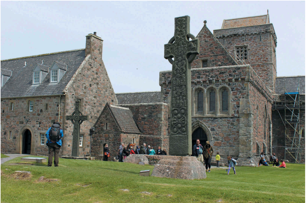
Figure 2. Crosses from left to right, St John's (replica in original base), St Matthew's (empty base in front of group of visitors) and St Martin's, in front of Iona Abbey.