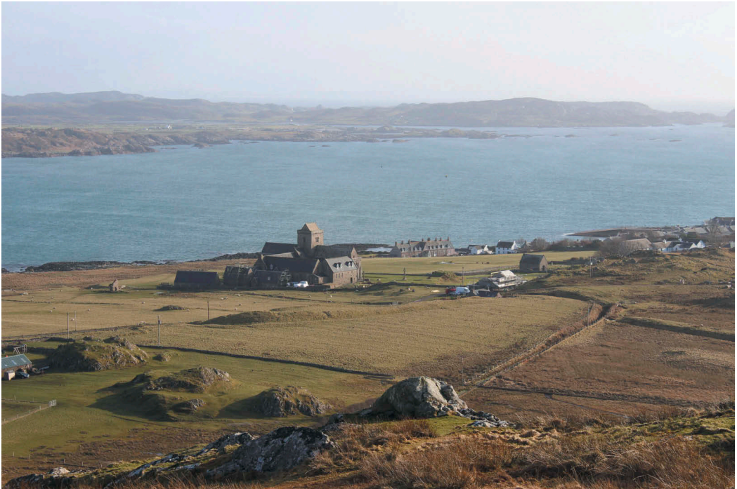
Figure 4. Iona Abbey in its landscape setting.