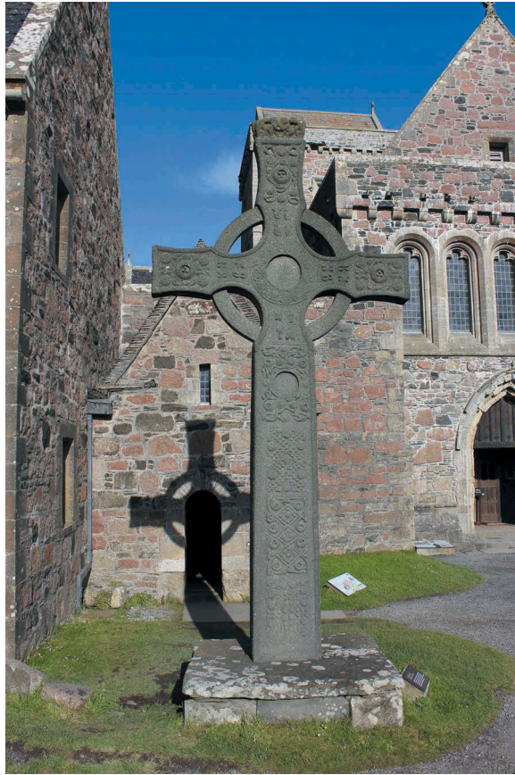
Figure 5. St John's Cross replica casts a shadow on St Columba's Shrine.

a timeless quality, which the original in the museum no longer conveys in the same way. As Dora reminds us, 'emotion springs up unbidden, and the museum doesn't do that for me'.