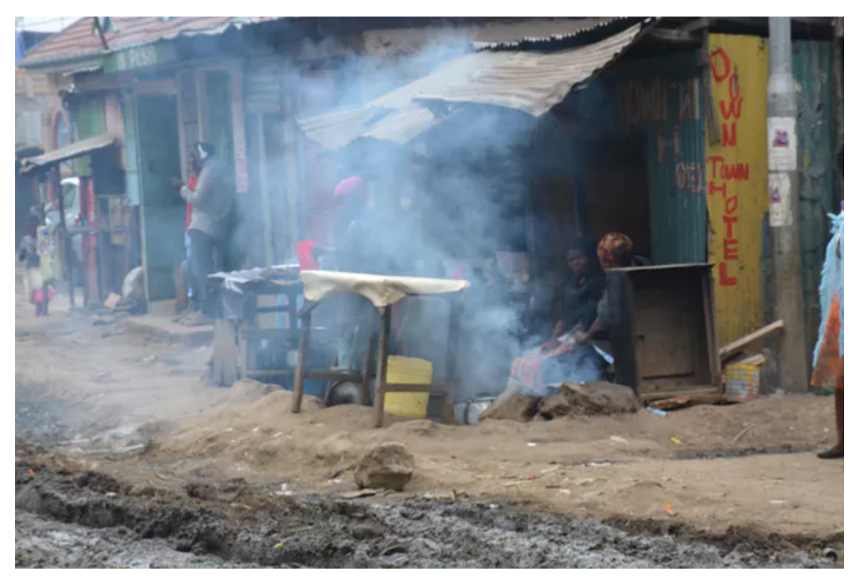
Women cooking in Mukuru.

Current approaches to reducing exposure to air pollution in informal settlements include awareness raising and campaigns on how to reduce exposure. But these methods have very little input from the people they target. As a result, they may have a low rate of acceptance. Campaigns also generally focus on one source of air pollution, but effective solutions and improvements to health need to take into account all sources of exposure.