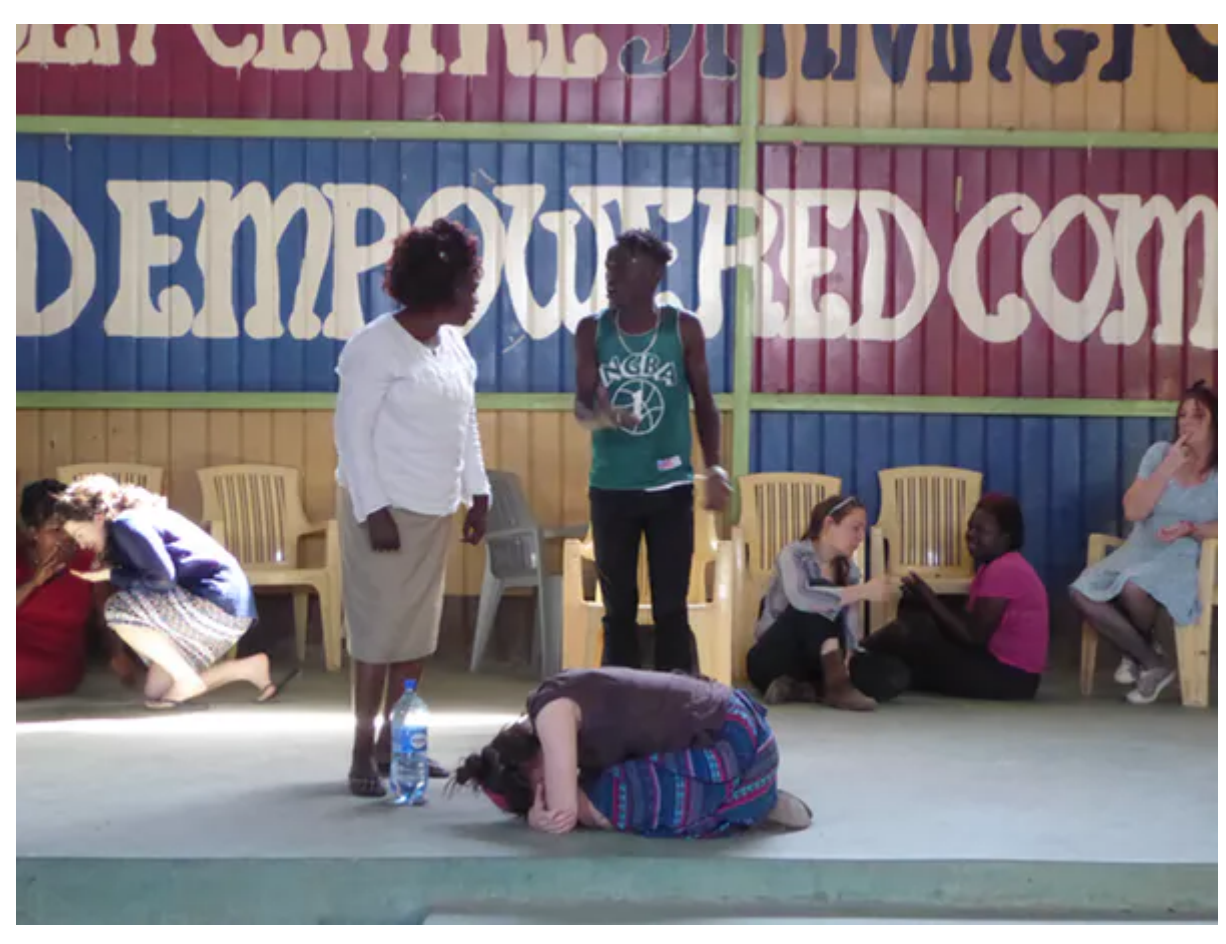
Forum theatre in Mukuru.