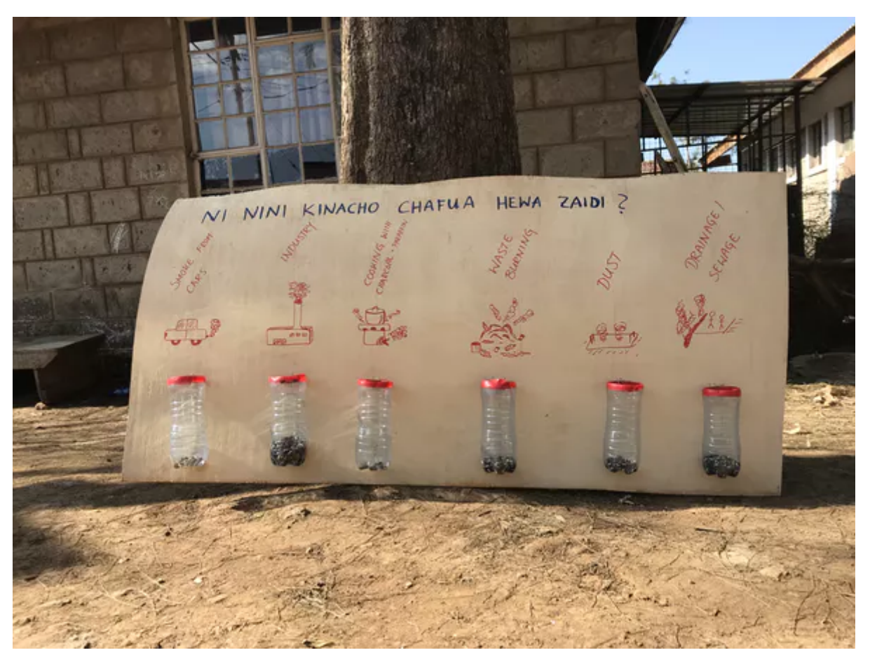
What are the main sources of air pollution?

In September 2018, these activities culminated in an arts festival, Hood2Hood, at the local football ground. A stage and a sound system appeared out of nowhere. Forum theatre and storytelling pieces were performed. Rappers, MCs and dance groups played live. A mural was created. Visual and interactive games were used to collect data. Around 1,500 local people attended the festival during the course of the day, to find out what we had been doing and to make their own contributions to discussions around air pollution.