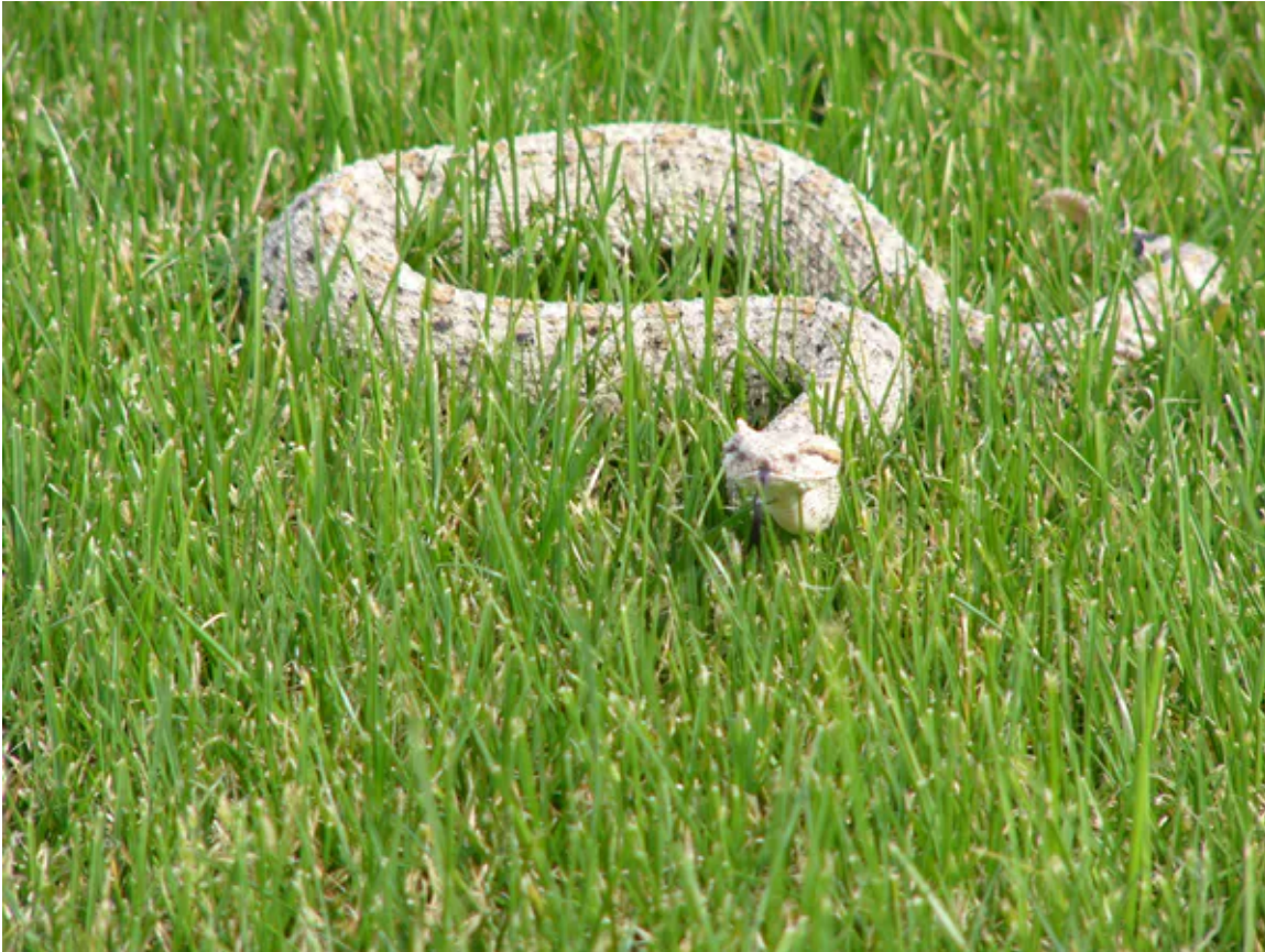
A rattlesnake flattens and shifts grass aside to get a clear shot at prey.

Decluttering their space may give them a clearer path to potential prey – extremely beneficial for a predator that cannot correct its aim after launching an attack.