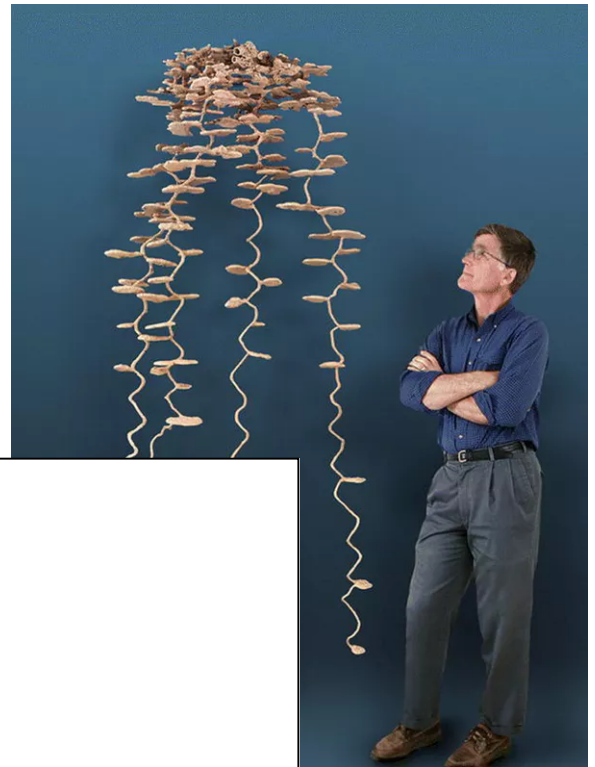
with visible tunnels and

In one study, scientists planted cables and a thermometer in a mole rat burrow, which were promptly cleared away by the “cleaning crew”.