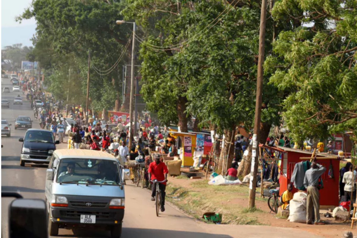
On the move, outskirts of Lilongwe, Malawi. hecke61

Our response is called Safe Roads Africa, an interdisciplinary group from Scotland and Malawi that includes clinicians, academics, NGOs and community workers. We have been running pop-up events and community meetings in two areas of the country. These have included using role play and community theatre to explore how people response to traffic collisions, and how this can be improved. We have also extended these events to neighbouring Zambia with encouraging results.