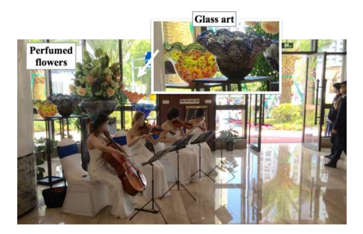
Fig. 2. Classical quartet serenade against upsurge of perfumed flowers<sup>4</sup>

To momentarily revert back to a domain-based CMT analysis, this classical quartet serenade suggests a different source situation from the forecourt, with implications for conceptual mapping onto the target. According to Forceville's (2009) case study analysis of commercial advertisements, music can trigger a range of positive qualities to be mapped onto the target domain (which is unequivocally the product on sale). Similarly, qualities associated with the classical music genre may be evoked upon entering the sound scape of the showroom: elegance, sophistication, refined musical tastes, and even enlightenment or spirituality, for example.