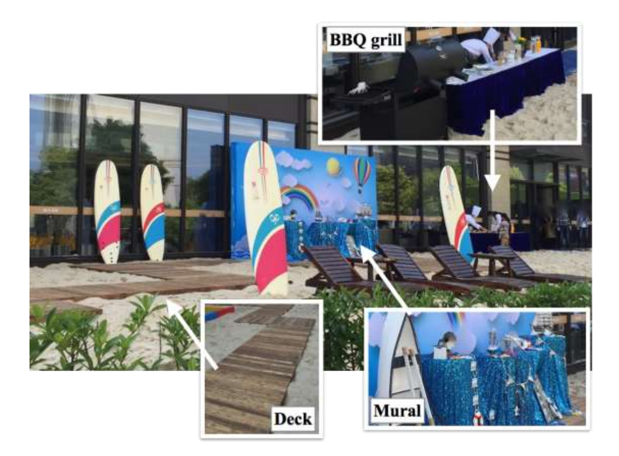
Fig 1. Secluded beach set-up with private BBQ grill manned by Carte Bleu Chef<sup>3</sup>

From the perspective of CMT, we can immediately identify the image-offering field (Müller, 2008) or source situation (Musolff, 2009) made implicit by the material structures on display. Images and objects have been arranged, we could argue, to suggest a secluded beach scenario, possibly at an international holiday resort. Conceptually, visitors approaching the showroom are invited to map the otherness of the simulated surroundings onto their first impressions of a Target domain – in this case the housing estate under construction. The beachside theme (along with the name of the development 'Ningbo Bay City') is consistent with the exclusive riverside location of the saleable plots (which are yet to be developed). Such themes would imply consequences for novel metaphorical mappings from domains of seclusion, nature, and