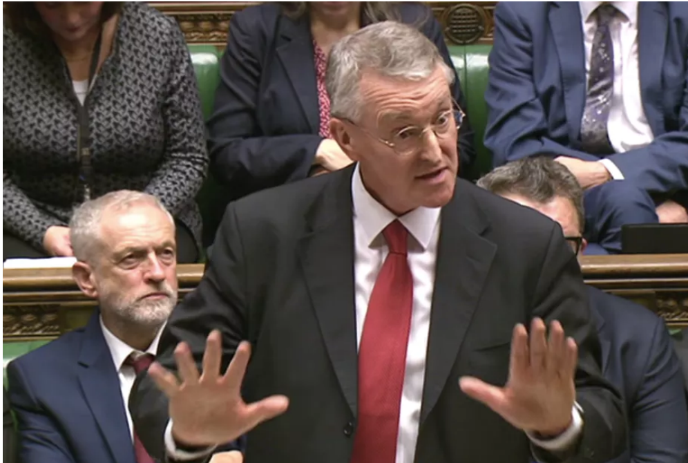
Hilary Benn, in the middle of his “tour de force” speech.