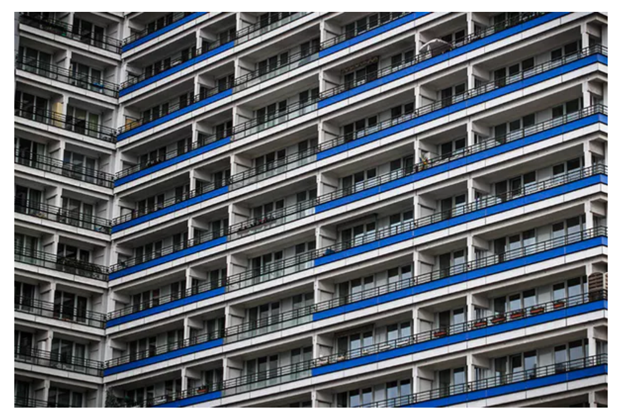
No vacancy.

German research has revealed that buying and renting flats to tourists – via online agencies such as Airbnb and Wimdu – has become highly profitable, with some businesses managing hundreds of properties. Partly as a result of this, Berlin – which once had a surplus of accommodation – now finds itself with a severe and growing shortage.