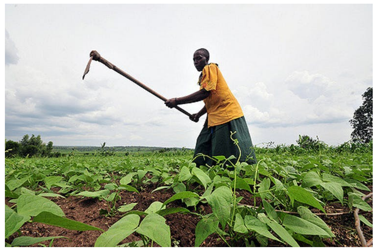
Farm fears.

Similarly, the UK has in recent years been the strongest voice for reform of the CAP . As European fisheries and farmers have been subsidised through the CAP, to the disadvantage of African farmers, reform is essential. Other European countries have been reluctant to commit to it.