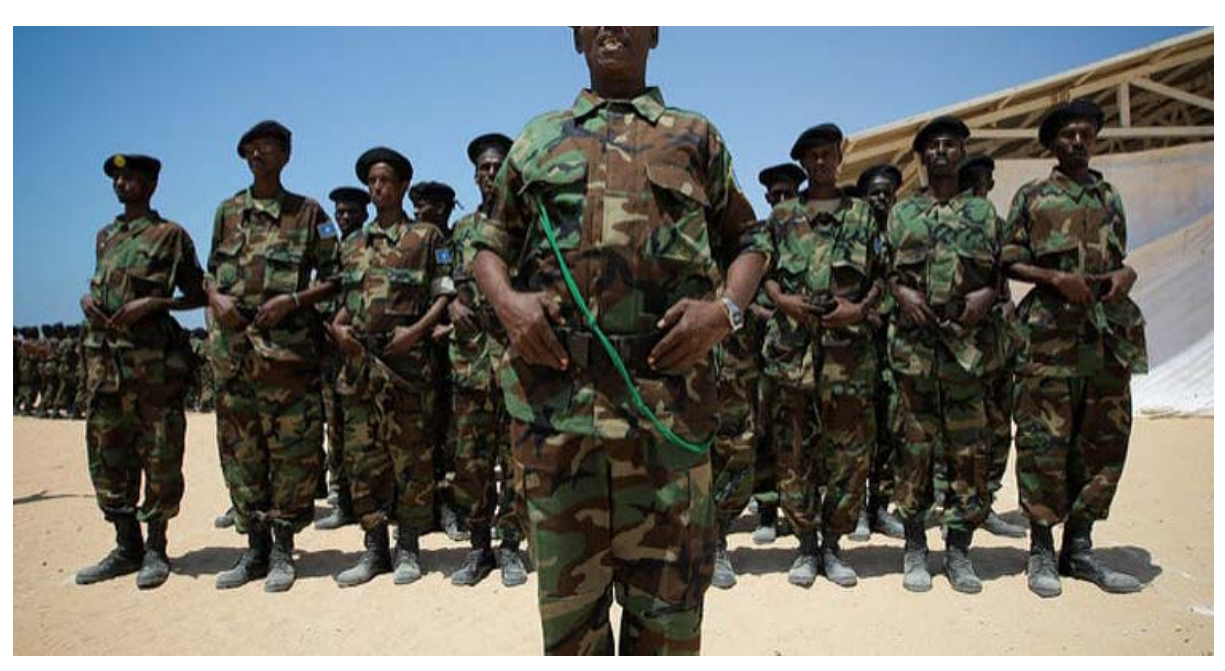
Somali soldiers at a passing out parade after training.

Brexit also has implications for the broader direction of the EU's Common Security and Defence Policy (CSDP) missions, the majority of which take place in Africa. Within the CSDP, the UK has always been a strong backer of prioritising peacebuilding and conflict prevention. This is in contrast to the French approach of a stronger military focus as the main peace and security practice. The withdrawal of the UK might thus translate into an identity change for the EU's security architecture and its security practices in Africa, especially if France fully reasserts dominance.