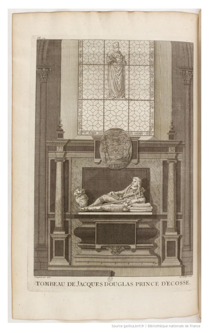
Figure 3. The tomb of James Douglas as it appeared before the revolution (Jacques Bouillart, Histoire de l'abbaye royale de Saint Germain des Prez [Paris, 1724], facing 219).