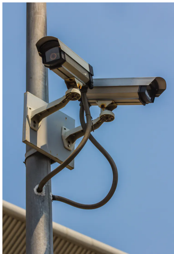
The future once. TUM2282