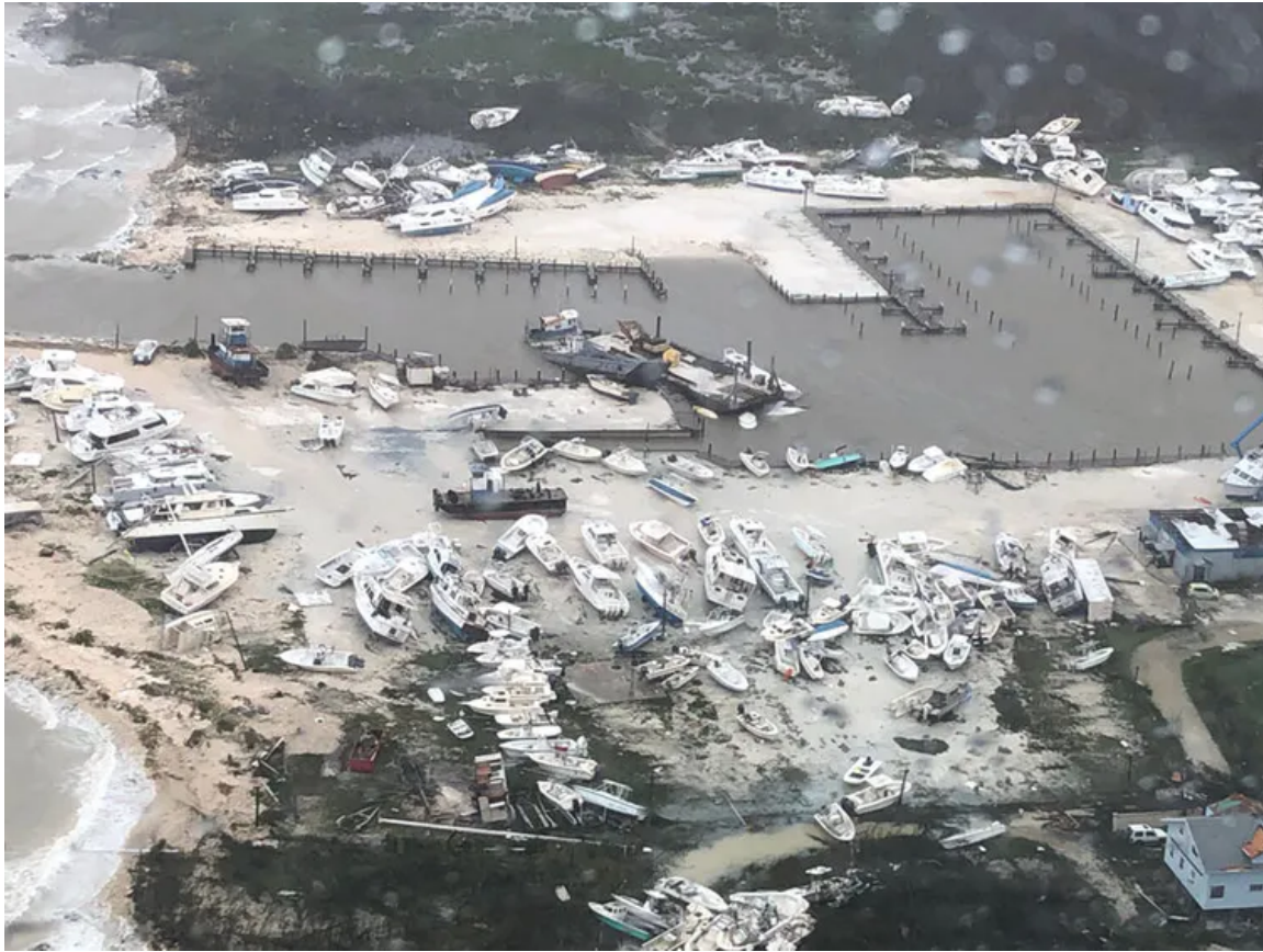
Hurricanes like Dorian make obvious news stories. The slow rise of atmospheric carbon, not so much.

Nevertheless, this issue cannot be explained in these terms alone. The most recent study into news values suggests that “bad news” and “magnitude” are two of the key elements in stories that become news. The extinction of much of the life on earth certainly meets both of these criteria. But when it comes to climate breakdown, these important news values can clash with the values of what the same study describes as the “newspaper agenda” and “the power elite”. This means that power structures within the mass media prevent climate change being covered as a topic of great importance.