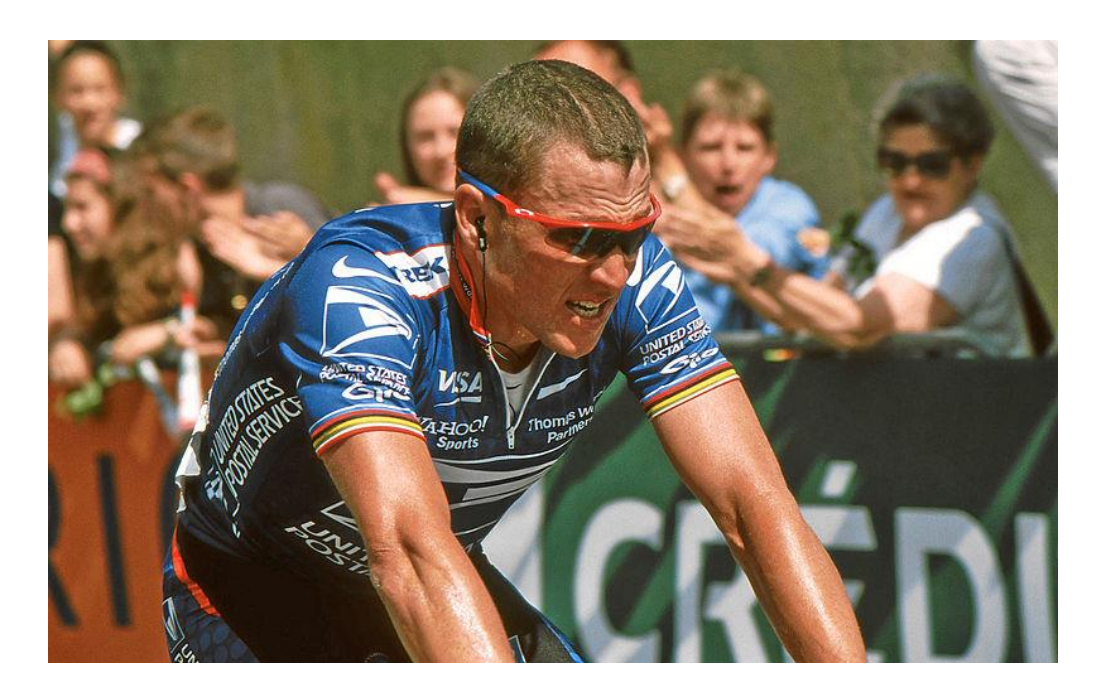
Figure 8.5 Group-serving bias amongst fans

Note : When an athlete — such as Lance Armstrong, pictured here — has been found guilty of illegal or illegitimate sporting behaviour, their supporters will often display group-serving bias in their explanations of the infringement. For example, they may downplay the significance of the behaviour (i.e., attributing it to non-dispositional factors) and/or suggest that it was more a consequence of the environment (i.e., attributing it to situational factors). They will also often display the same reason, belief, and marker asymmetries as the athlete themselves.