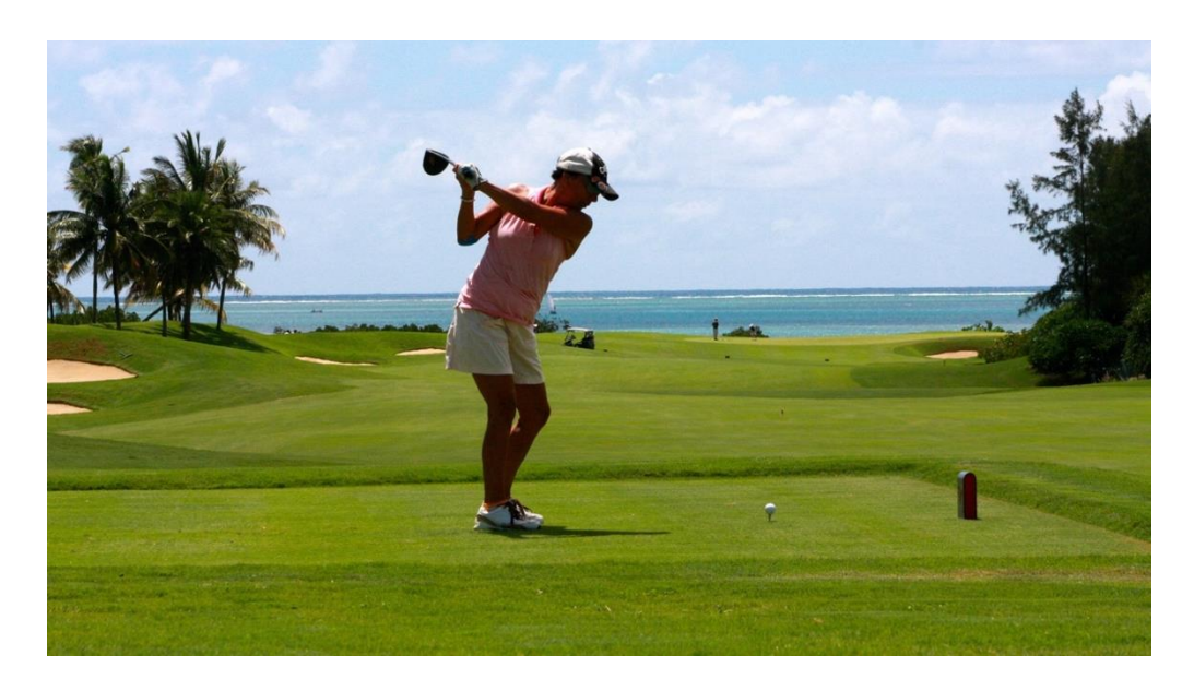
Figure 8.1 Attributions matter

Bernard Weiner (1985) proposed that human behaviour can be motivated by the way individuals explain the causes of events or behavioural outcomes. Take, for example, the case of a golfer, Cathy, who fails to make the cut in a major tournament (see Figure 8.1). Weiner's (1985, 2012, 2018) attribution theory suggests that the way she explains this outcome to herself will have consequences not only for her well-being but also for her future behaviour — such as, her motivation to come back and try to make the cut in the next tournament. In particular, the theory predicts that she is going to be more motivated to do this if she convinces herself that she adopted the wrong strategy, did not practice enough or that she was simply unlucky this time, than if she believes her failure is a sign that she just doesn't have what it takes to succeed.