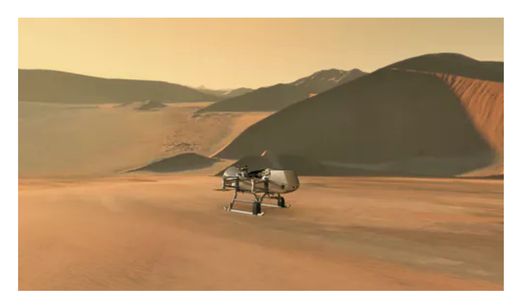
Artist's impression of the Dragonfly landing. NASA