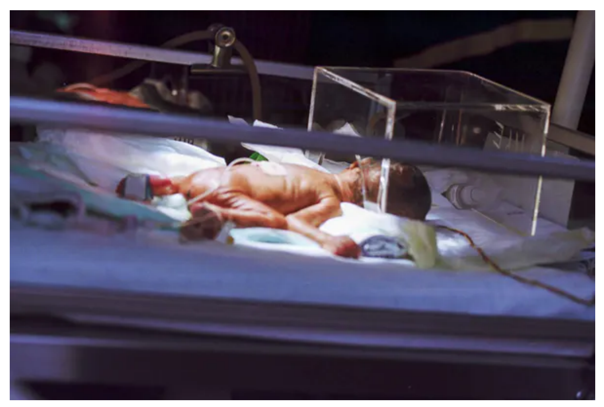
Parents of very sick children and their doctors need to find a way to get on without going to court.

Treatment decisions are usually made jointly between parents and clinicians. Parents often have some discretion to try approaches clinicians do not favour, but ultimately hospitals keep the "best interests of the child" as the main focus.