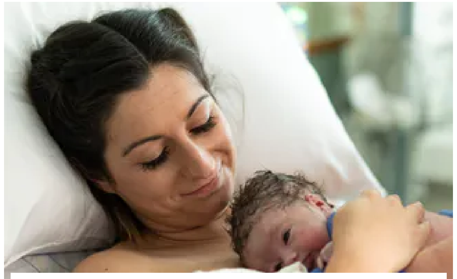
Most women give birth in hospital – but it's got more to do with World War II than health