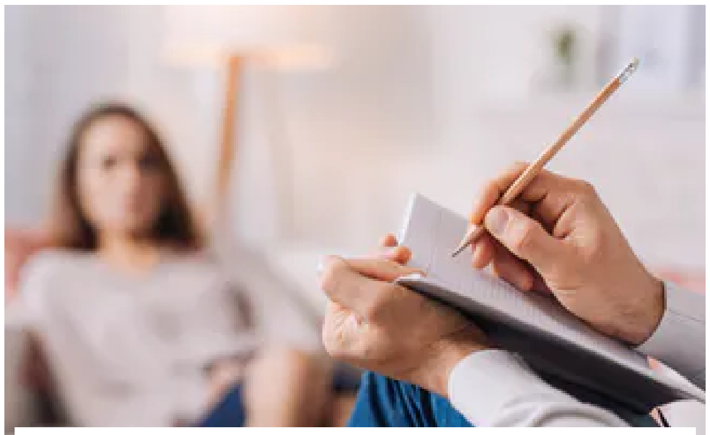
The UK doesn't spend enough on the mental health of young people – we found out why