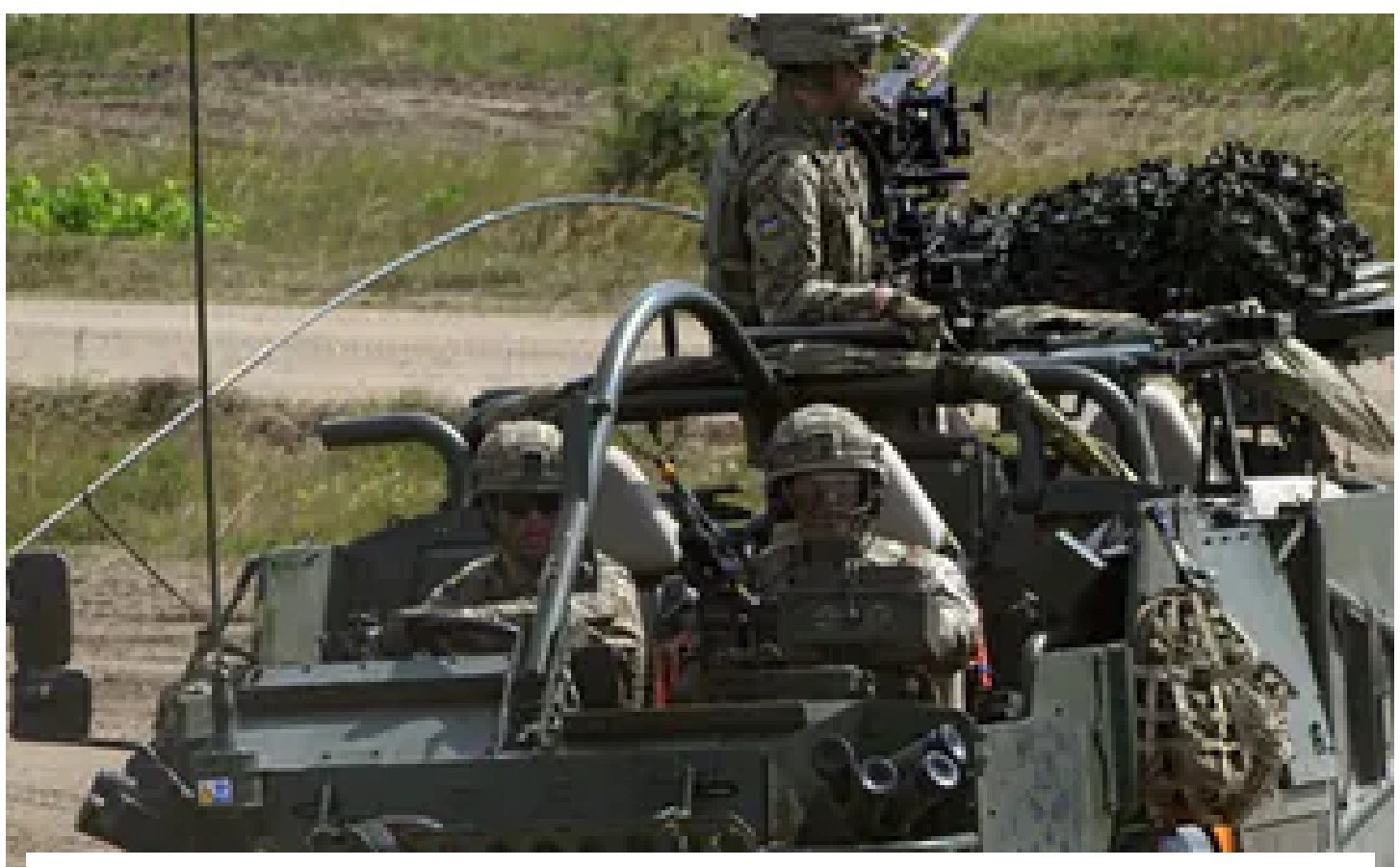
How important is NATO to British defence policy?