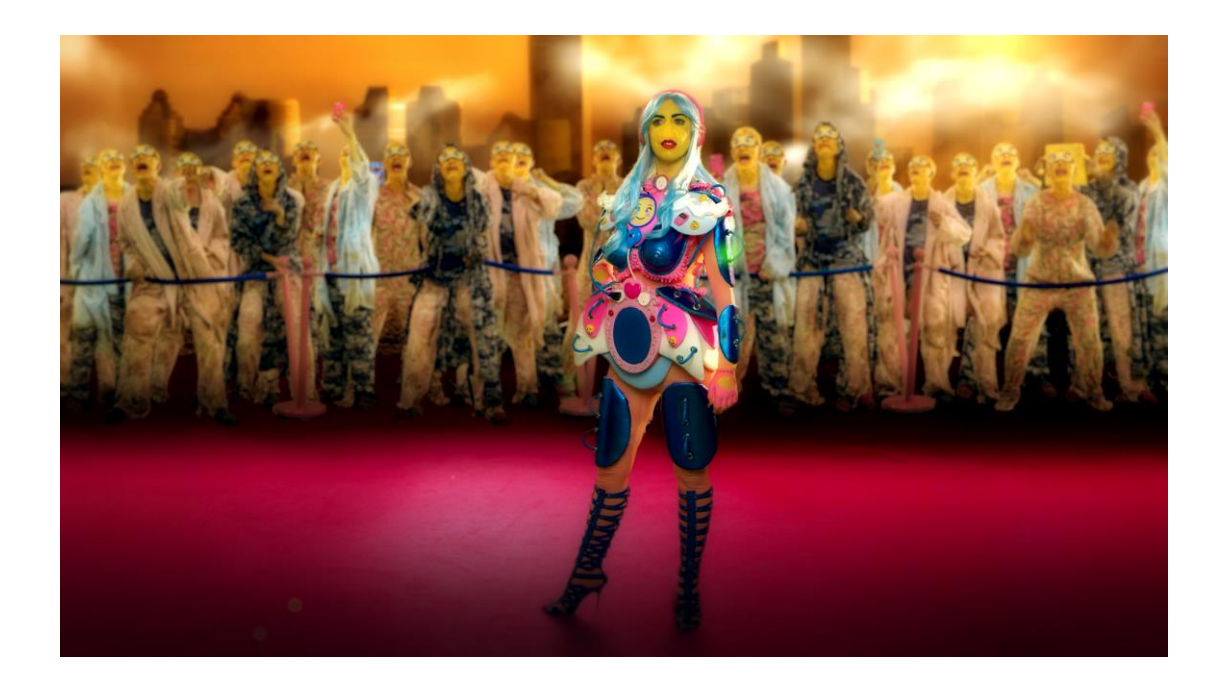
Figure 2: Rachel Maclean, It's What's Inside That Counts , (2016), (Image film still) : Courtesy, HOME, University of Salford Art Collection, Tate, Zabludowicz Collection, Frieze Film and Channel 4. insert: IWITC_3 SCREENS_40.tif

One of the most compelling aspects of Maclean's films is the intensive labour that has gone into their making, visible in their maximal aesthetic. Up until recently (around 2016), they have generally been low-budget productions, usually made for a few thousand pounds, which were, by nature and necessity, one-woman shows; the elaborate sets and costumes are all created by Maclean herself who also acts in, writes, directs and edits her films. At art school, Maclean began experimenting with green screen technology and constructed a screen in her bedroom to perform her characters in front of. Although the budgets for Maclean's films have steadily increased alongside her growth in notoriety as an artist, her approach has remained relatively consistent with the practice she developed as a student, suggesting that this multiple-role approach has significance beyond the 'needs must' dictate of low budget productions.