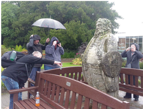
Figure 1. The 'How Old Are Yew' group recording the Falstaff sculpture in Calderglen, East Kilbride.