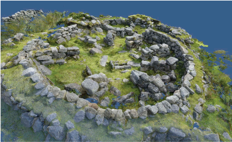
Figure 5. A screenshot of the highly detailed photogrammetric model created by ACCORD and Access Archaeology of the Grimsey Wheelhouse, North Uist.