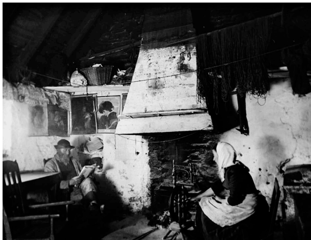
Figure 4. Laurence 'Lowrie' Manson sitting with his daughter at the southern end of the manse, Cullingsburgh, Island of Bressay.