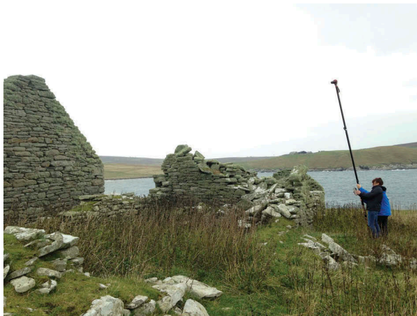
Figure 3. Bressay History Group recording at Cullingsburgh Manse, Island of Bressay, Shetland.