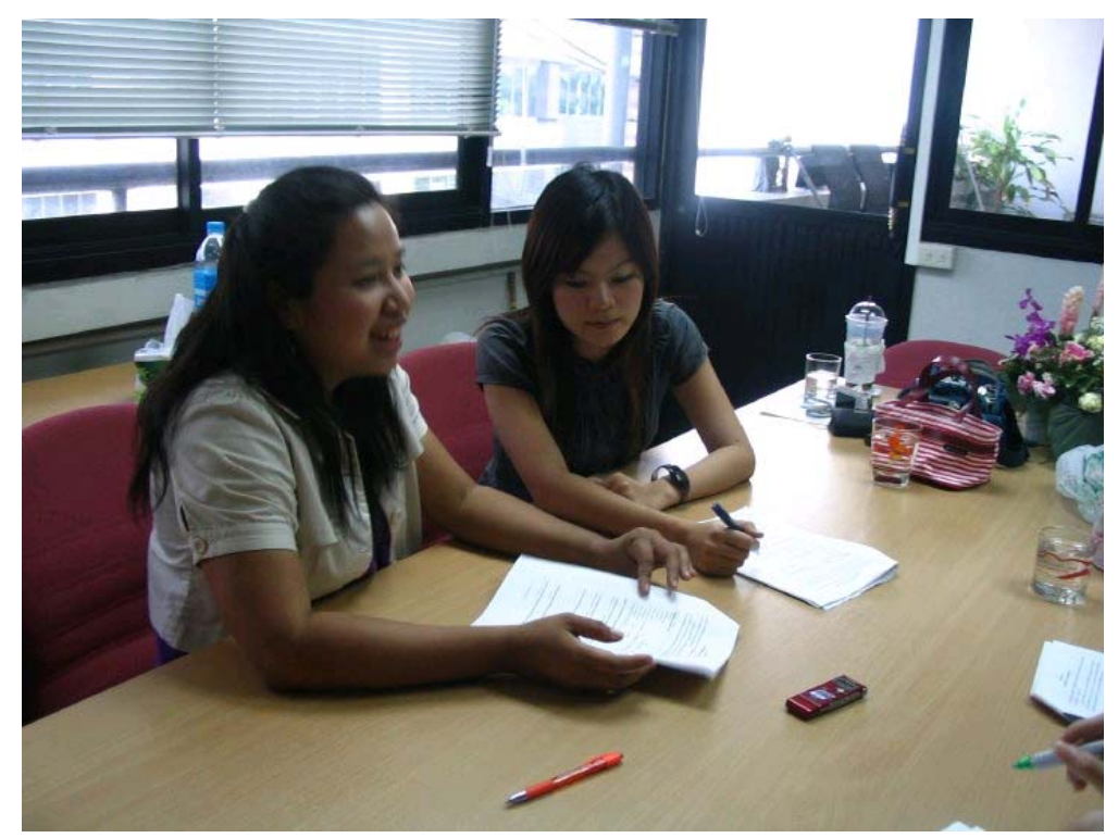
Interviewing a juniour practitioners at UTCC