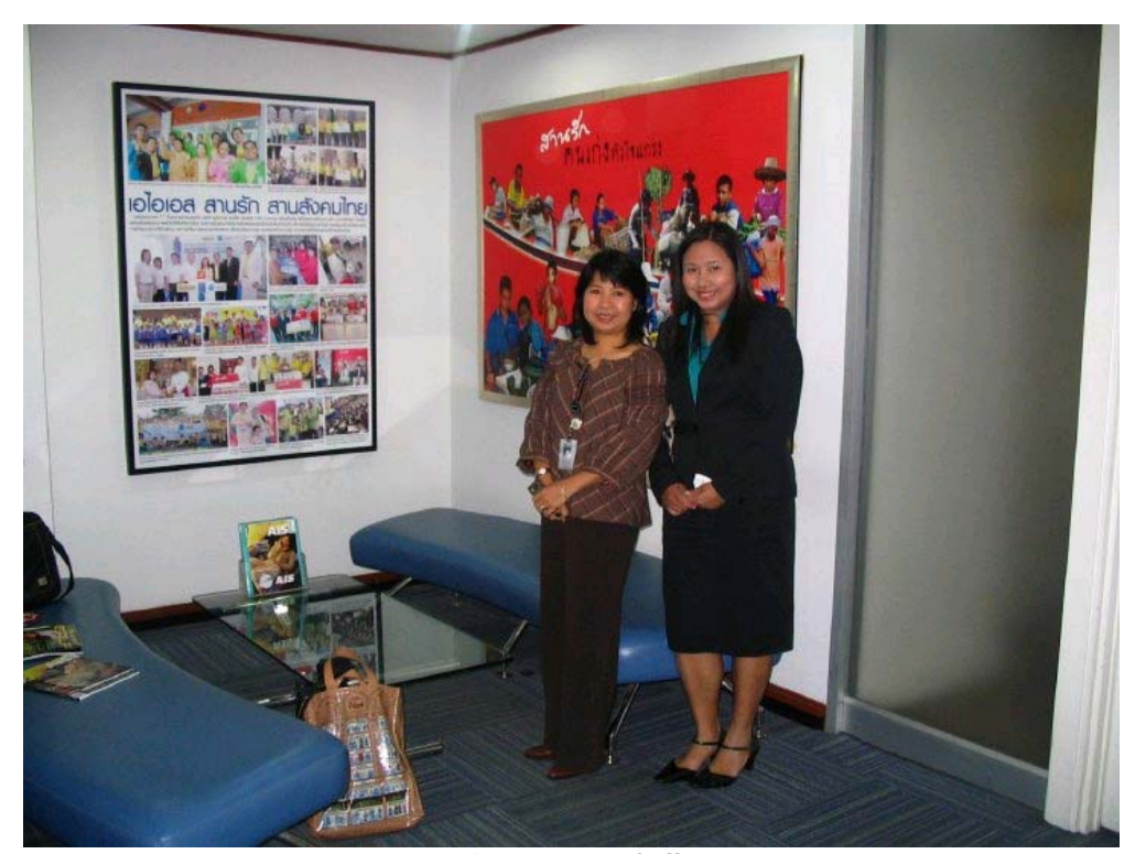
At the interviewee' office