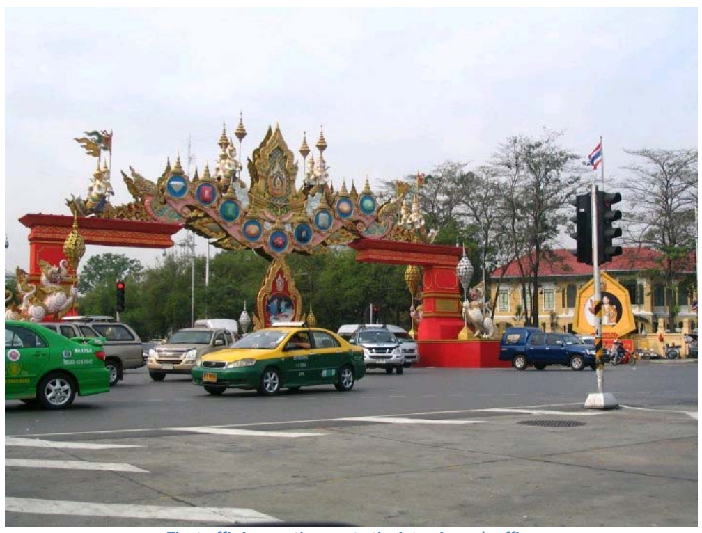
The traffic jam on the way to the interviewee's office