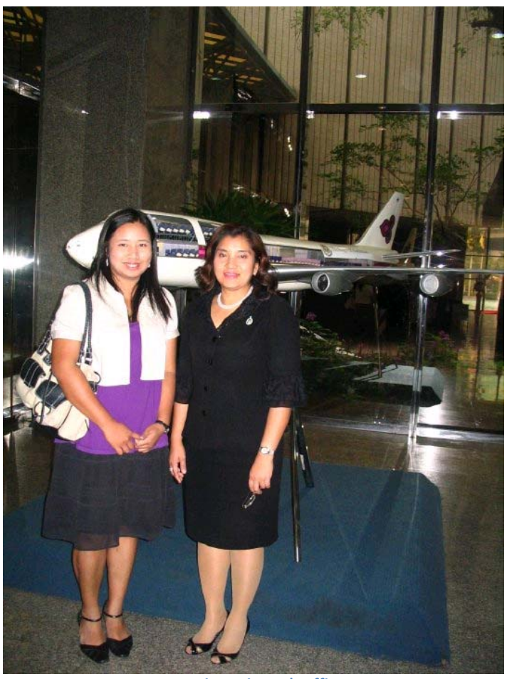
At an interviewee's office