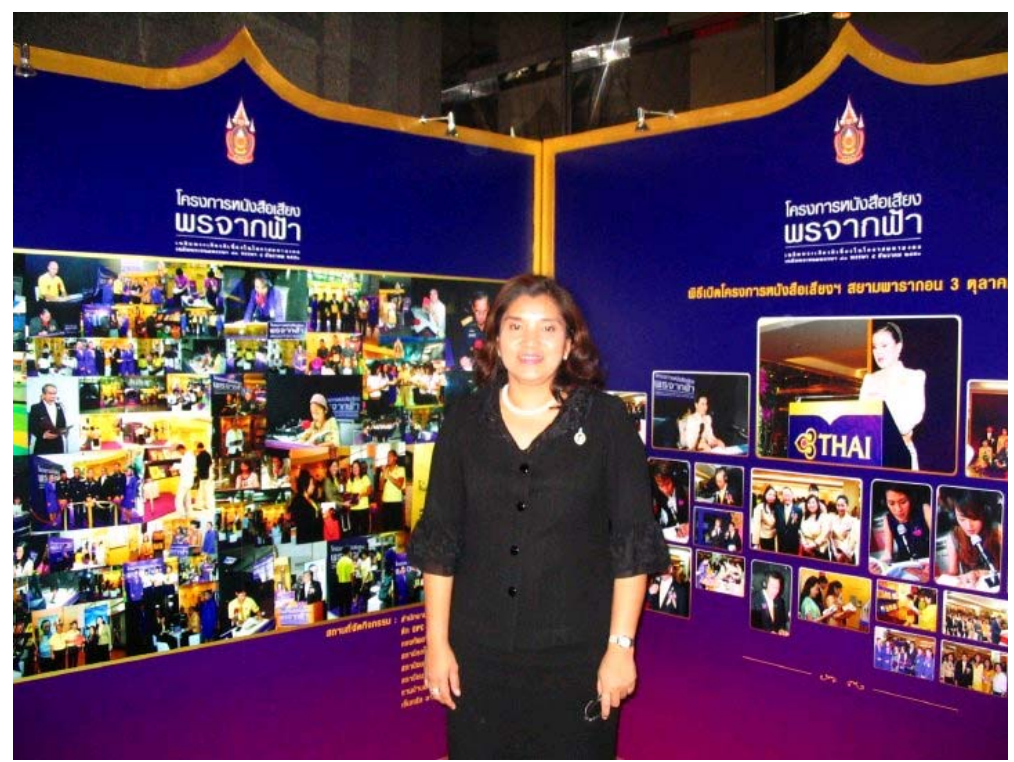
An interviewee with her exhibition