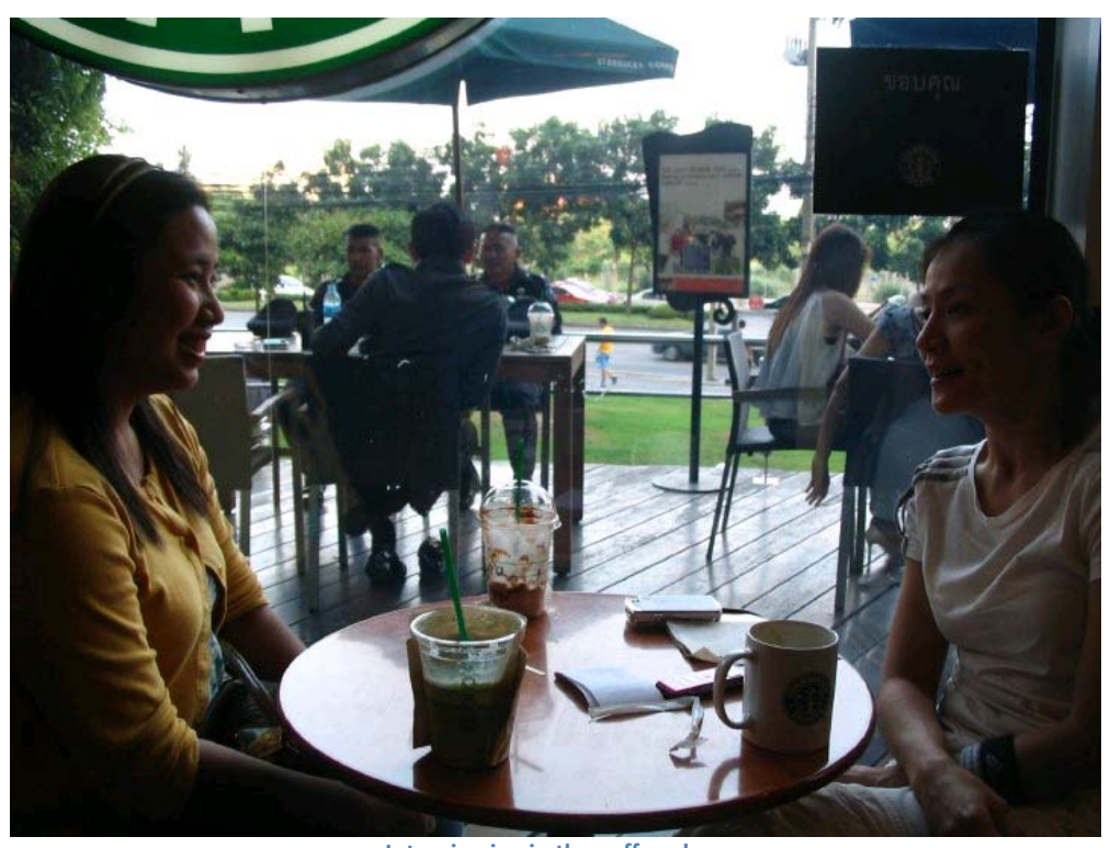
Interviewing in the coffee shop