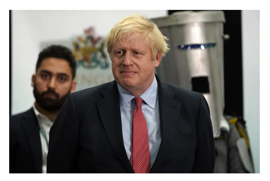
Boris Johnson: heading back to Downing Street.

December 13, 2019 4.34am GMT •Updated December 13, 2019 7.35am GMT