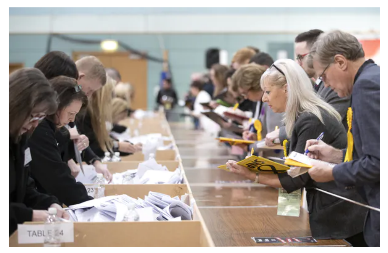
Counting underway in East Dunbartonshire.

Even in economic areas, the potential wrangling over goods, services, capital as well as other areas where the UK and EU might want to cooperate is fraught with difficultly. The state of Swiss-EU relations where negotiation and renegotiation is the norm shows that "get Brexit done" is a hollow sentiment. But having argued for it and got his wish, the prime minister will now have to own it.