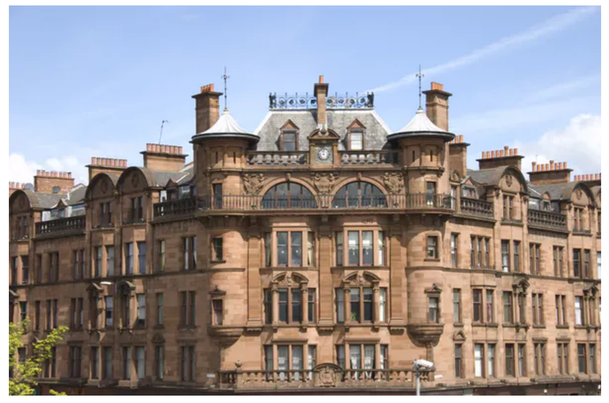
Glasgow has some beautiful old buildings but they can be difficult to heat.

control group from the same population, but the uptake accounted for just 6% of eligible households, at a cost of around US$1,000 per home.