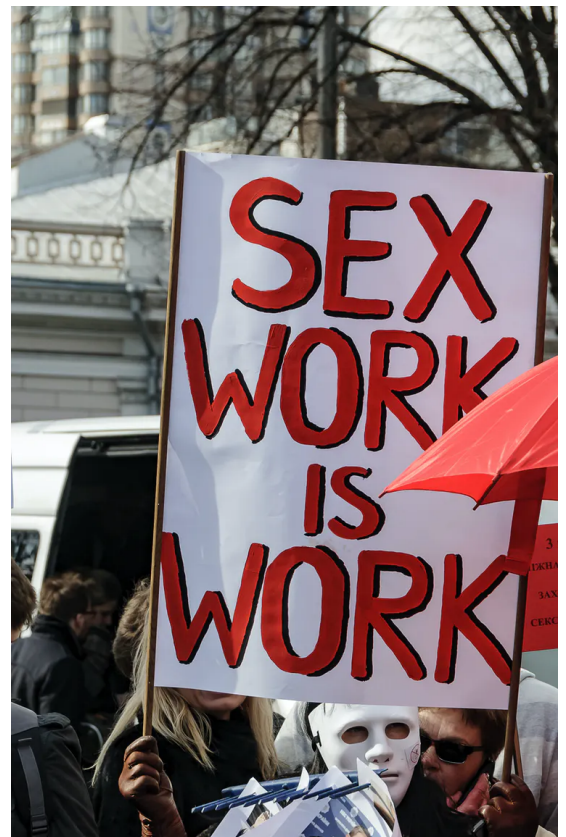
Many working in prostitution want to be recognised as workers entitled to rights and protections.

The state supports people wishing to stop selling sex via a programme of social and financial aid delivered through accredited charities and women's rights organisations. But recent research reveals this support package remains underfunded and unevenly applied. It has also been criticised for helping fewer than 100 people per year exit prostitution since the programme was introduced in 2017.