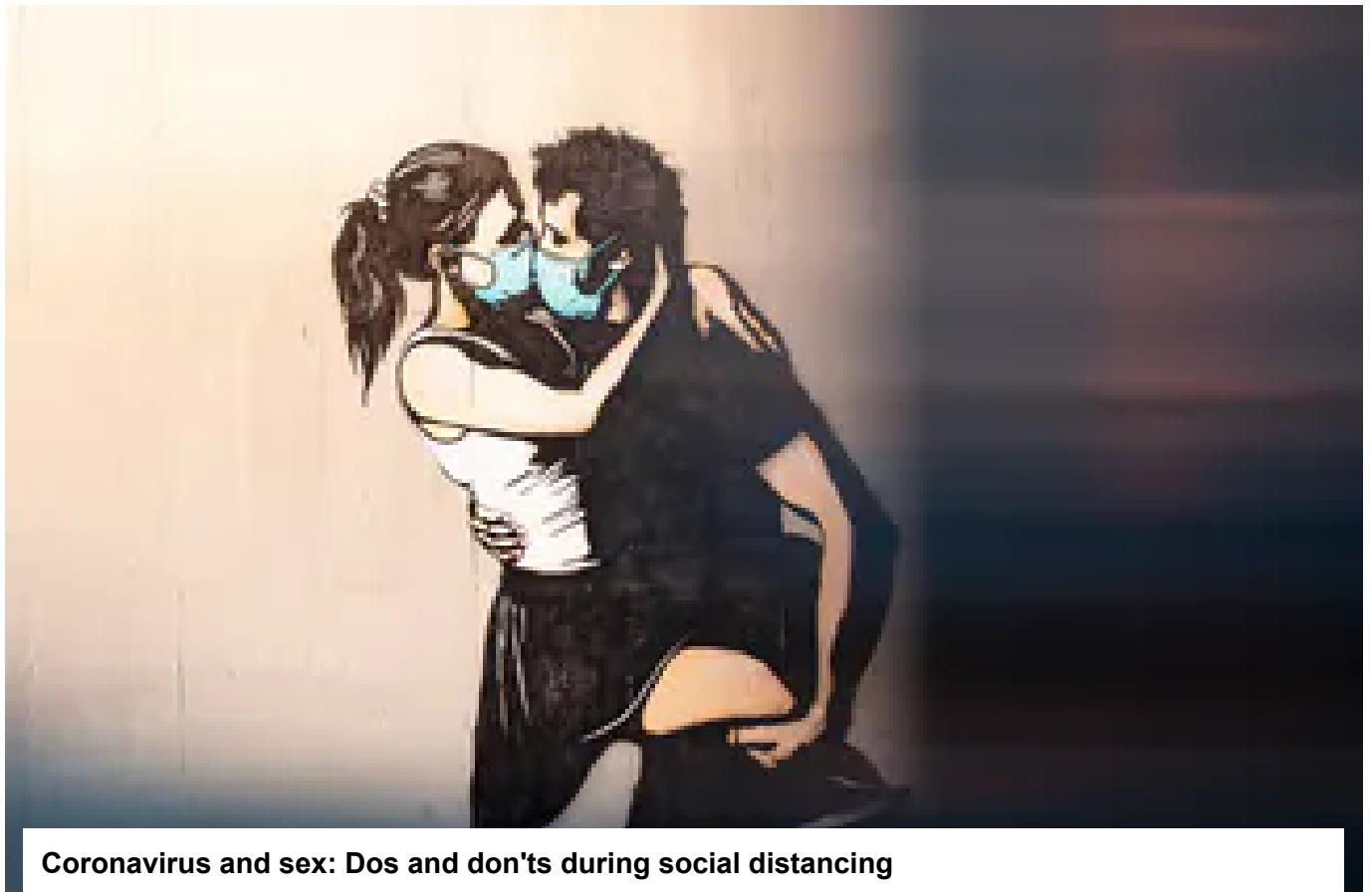
Coronavirus and sex: Dos and don'ts during social distancing