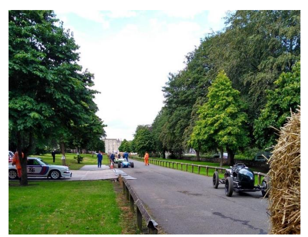
Image 3: Bo'ness Hill Climb 2019. Looking down the main drive towards the House

Oh! nature, the charms that thy beauties impart Far outstrip a' the gloss an' the tinsel o' art. Oh! Give me content and a heart that can feel The endearments o'love mang the woods O'Kinneil.