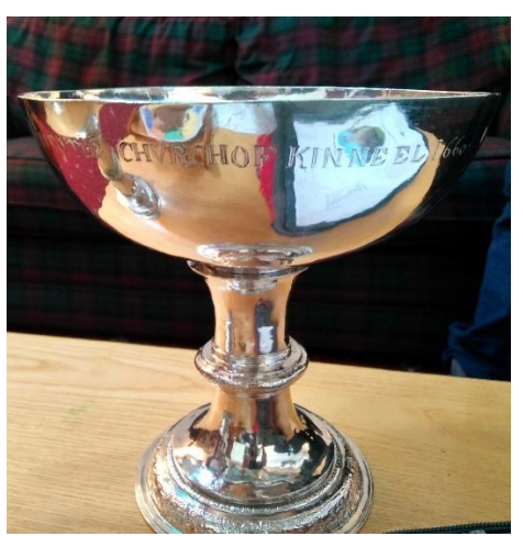
Image 4: Communion Cup, Bo'ness Old Kirk. Inscribed "This cup pertaineth to the Church of Kinneel 1660" [sic]