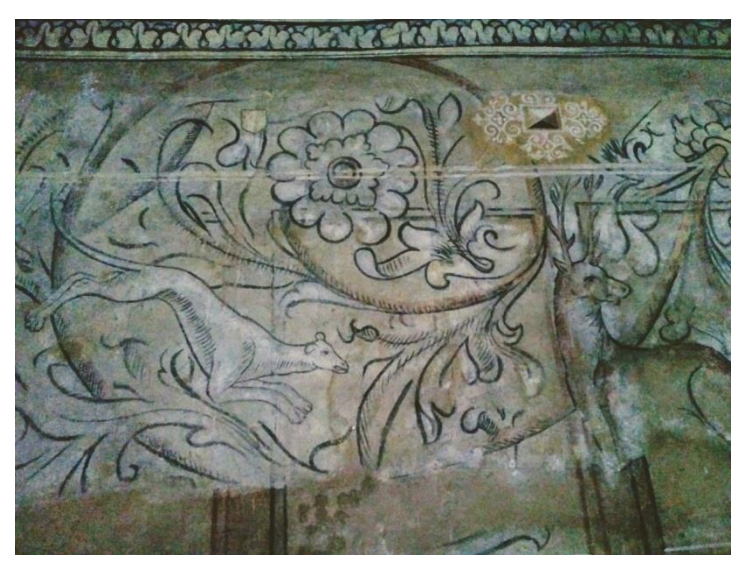
Image 6: detail from The Arbour Room showing two phases of painted decoration: naturalistic foliage and animal scenes (1550s) and imitation oak panels (1620s)

the discovery of the paintings in the 1930s that halted the demolition of the House and ultimately resulted in it receiving formal heritage status (for a full description of the paintings see Richardson 1941). In the 18<sup>th</sup>century, a workshop to the rear of the main House was used by engineer James Watt to work on the improvements to steam engine technology for which he would become famous (the unroofed walls of 'Watt's Cottage' are still standing). The House is unfurnished but medieval gravestones and a carved-stone Cross from Kinneil Church have been moved into the House and are displayed in the old kitchens, together with architectural fragments from other parts of the building. The House is open to visitors on specific days (around once per month March-October and for special events).