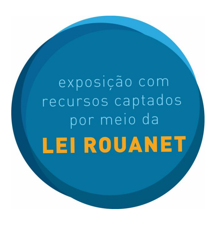
Figure 2. Lei Rouanet (unofficial) logo designed by the Forum: 'Exhibit made possible with funds raised through Lei Rouanet'.

Institutional Frenemies – collaboration and 'goallessnes'