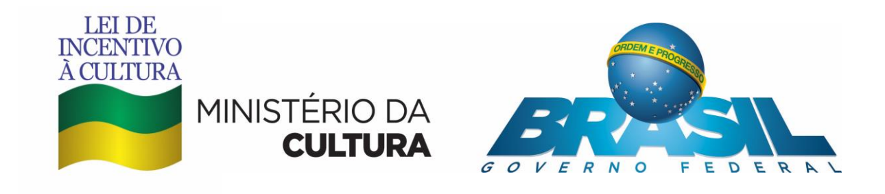
Figure 1. Cultural Incentive Law and Ministry of Culture Logos visible on all cultural events financed with tax money.