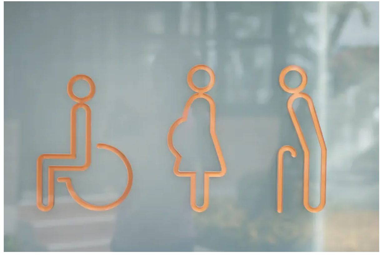
People with disabilities or special health conditions and needs have long had to deal with poor toilet provision across the country.

The pandemic has amplified this problem. Sanitation is more than just a means of disposing of bodily waste – it facilitates participation in society. Accessible toilets mean citizenship, dignity and belonging.