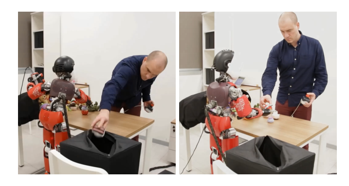
Fig. 1. Screenshots of the video stimuli: Low Coordination (left) and High Coordination condition (right).

chain in which the human grasps toys and passes them to the robot, whereupon the robot drops them into the container (Figure 1, right). In the High Coordination condition, the video lasts about 40 seconds; in the Low Coordination condition, the video lasts 37 seconds. In both conditions, the overall number of toys placed in the box is 4 (in the Low Coordination condition each agent puts two toys into the container; in the High Coordination condition all four toys are passed from the human to the robot).