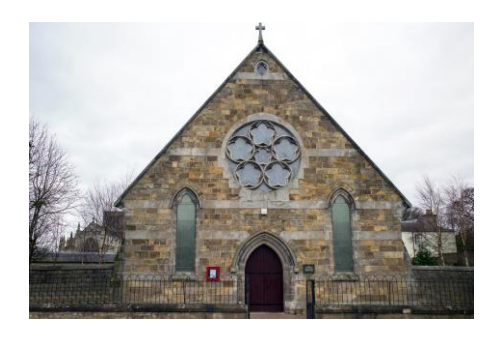
St Mary's R C Church