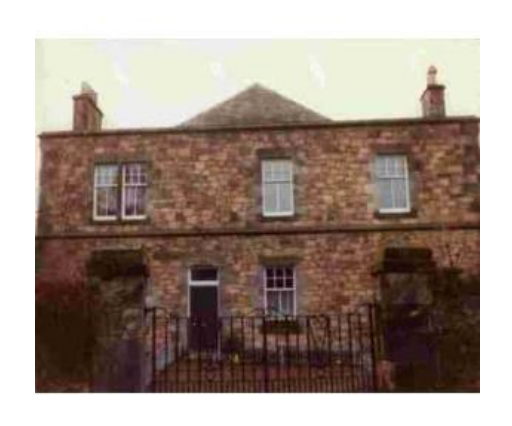
St John's Free Church