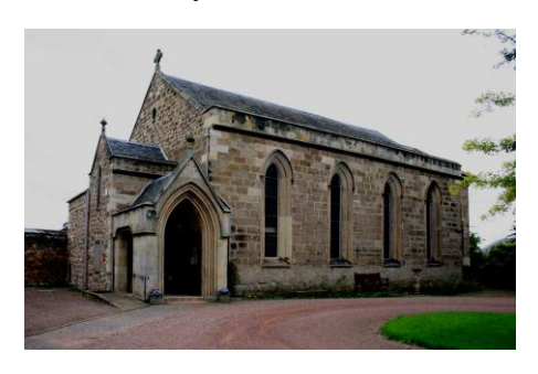
Holy Trinity Church