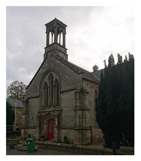
St John's Church