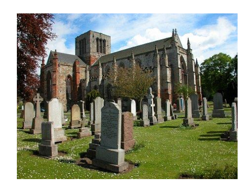
St Mary's Parish Church